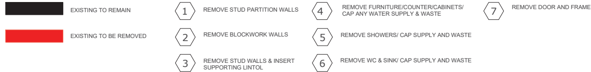
1 UNIT 338- EXISTING GROUND FLOOR PLAN