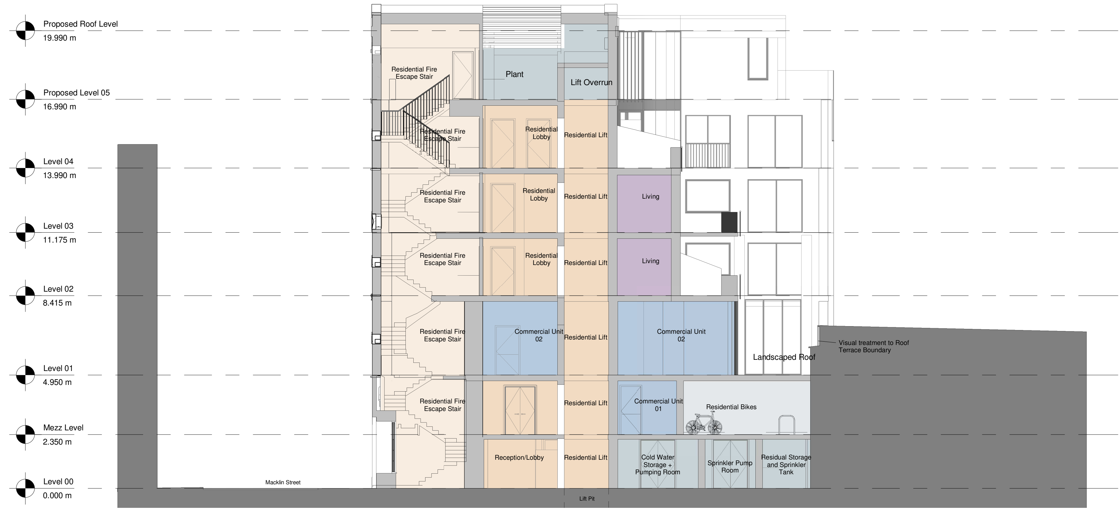
1 Wider Section BB - Proposed 1 : 100