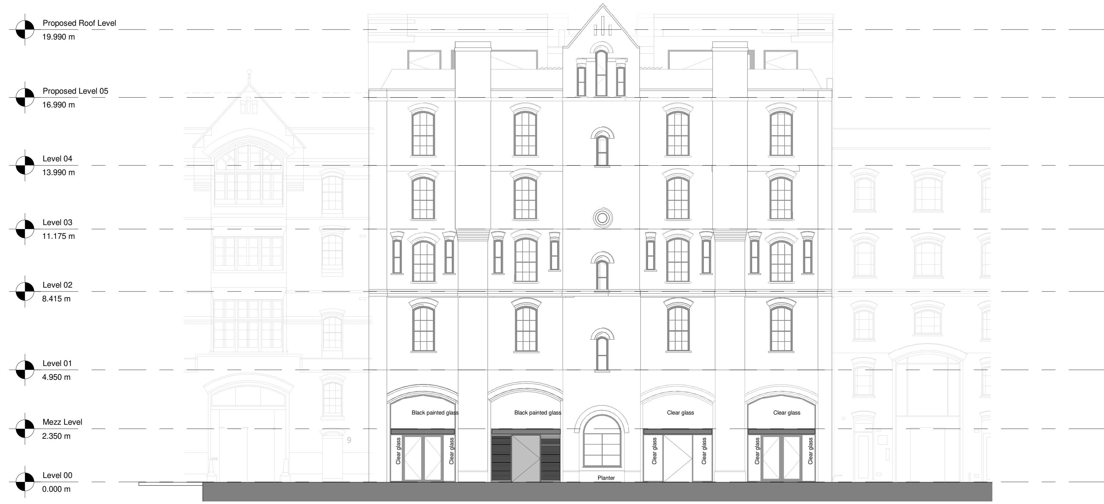
2 Elevation - Wider West - Proposed 1 : 100