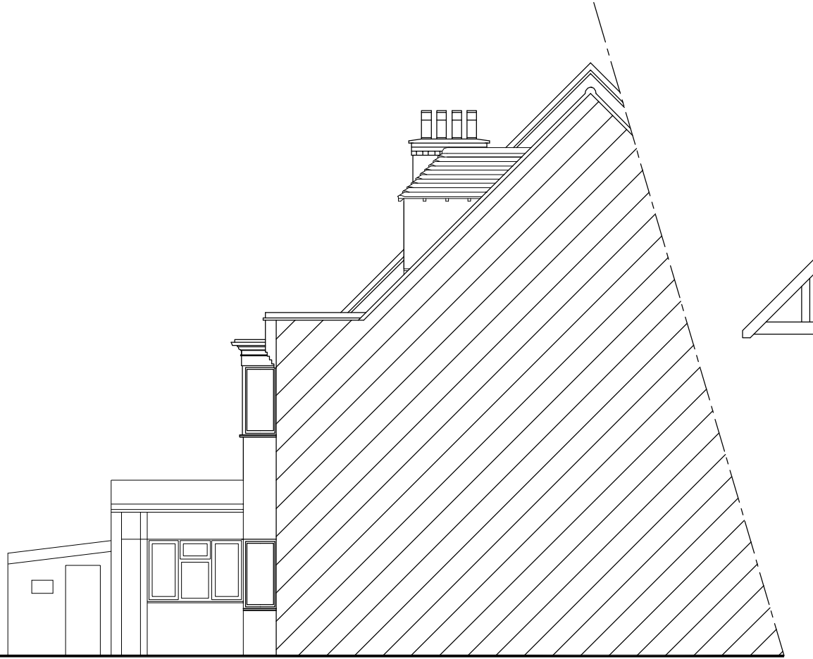
Boundary Side Elevation (no changes)

Just Plans is a trading name for Just Plans Limited, company number 10113667.