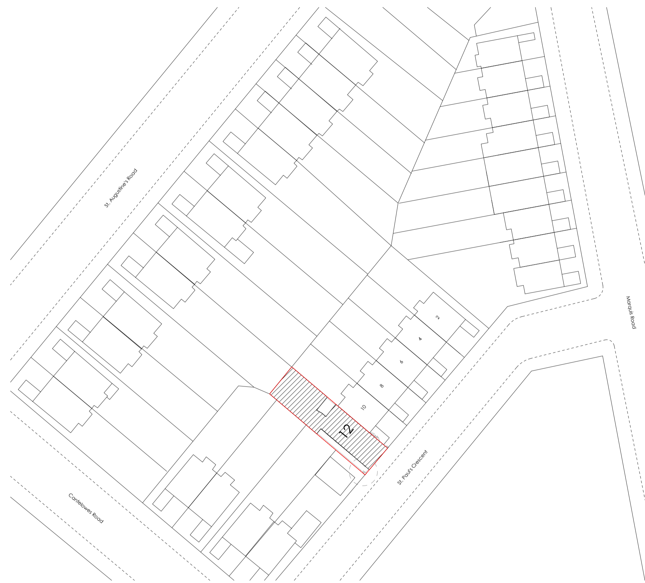
01 Location Plan 1 : 500