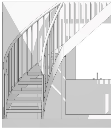
New floating stair

The existing secondary stair in the family room, serving the first-floor rear extension, is dated and unsightly so will be replaced with a modern 'floating' version with open treads to give a feeling of openness and allow the light from the new window to penetrate the room.