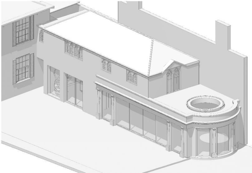
New sliding doors to garden room

The 1997 rear extension housing the indoor swimming pool will be retained although the pool itself decommissioned and infilled to create a garden/living room.