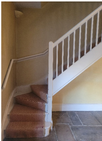
Existing secondary stair