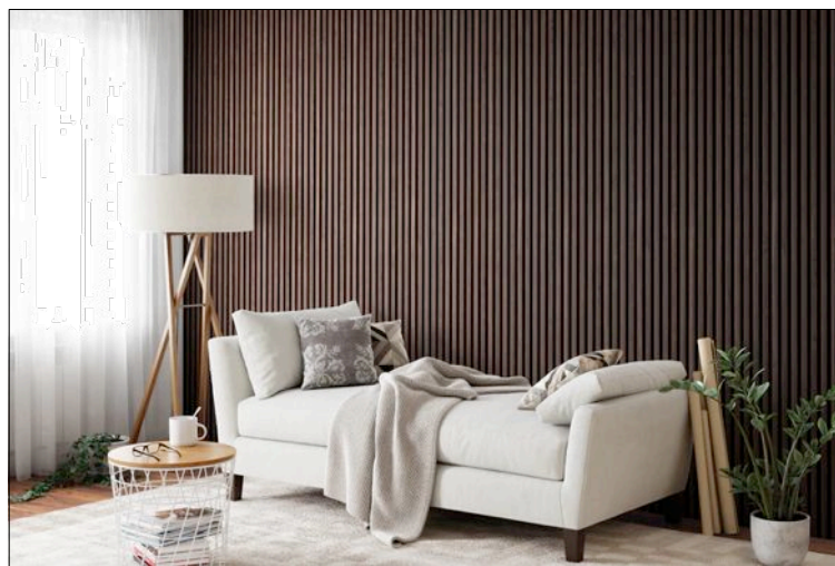
Fig. 2 - ACUPANEL Wall Panelling