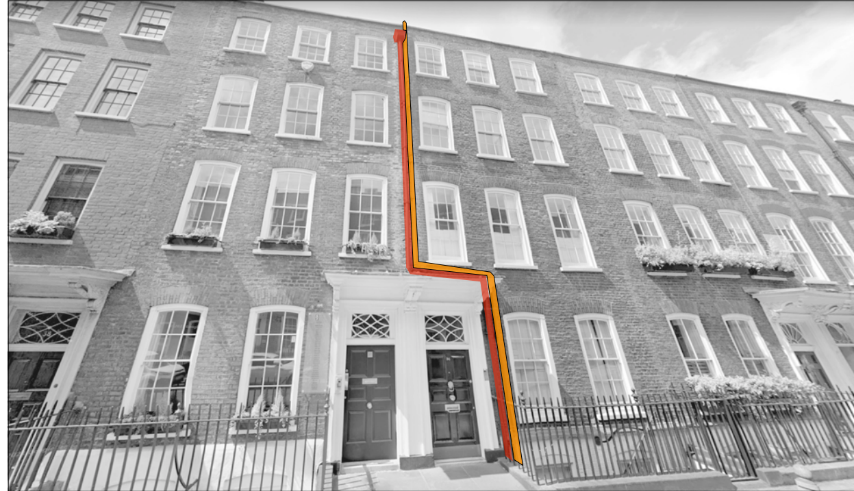
EXISTING VIEW - DIAGRAM : EXISTING RWP & SV PIPE