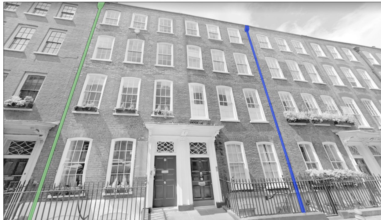
PROPOSED VIEW - DIAGRAM : PROPOSED RE-INSTATEMENT OF RWP PIPES

© Julian Harrap Architects All rights described in Chapter IV of the Copyright, Designers and Patents Act 1998 have been asserted. All levels are in metres above Ordnance Datum. All dimensions should be checked on site. Do not scale from this drawing. This drawing is for reference and information only. Any discrepancies should be reported to project lead. To be read in conjunction with the submitted design and access statement and other associated reports.