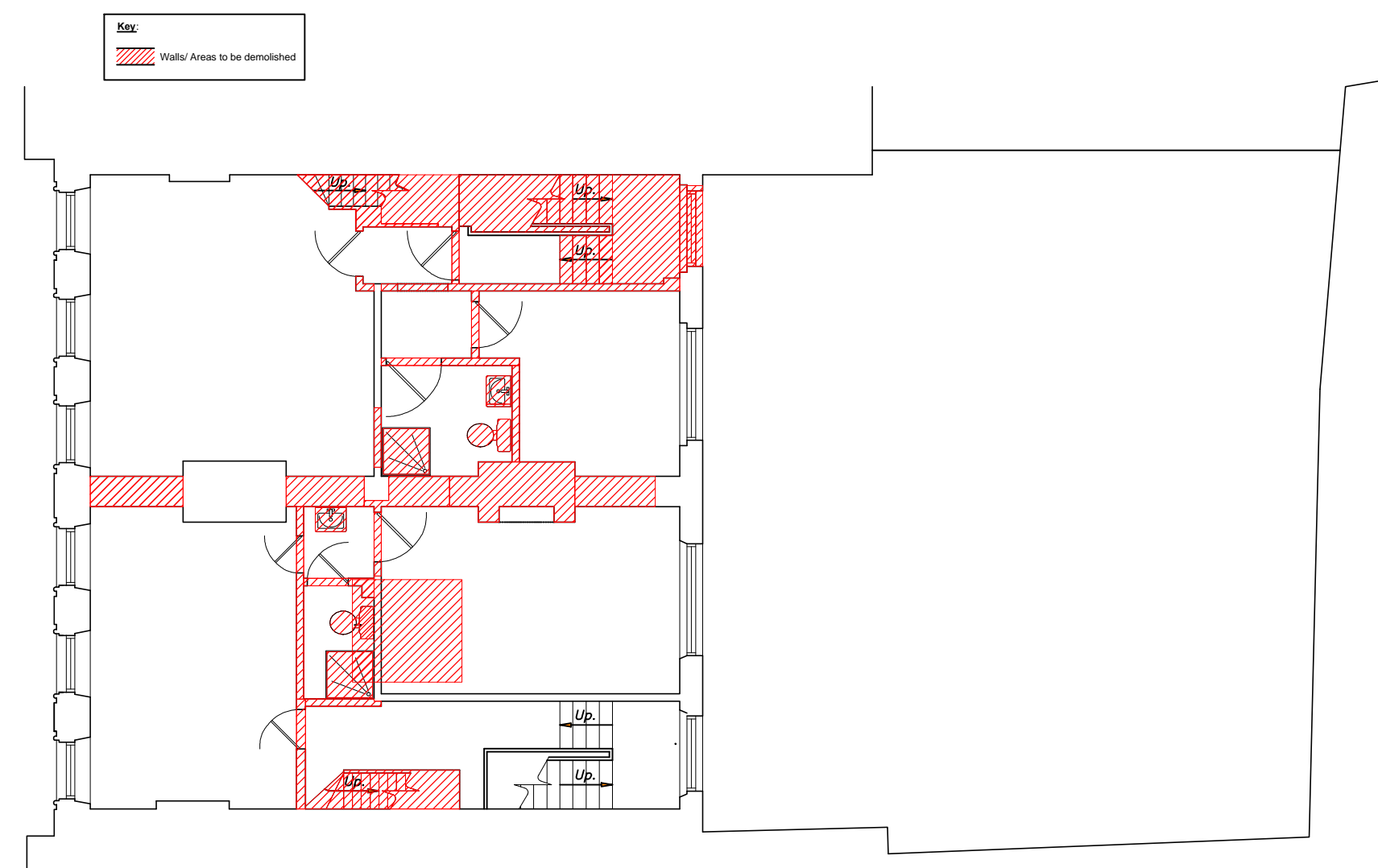
Existing Third Floor Plan & Demolitions Scale 1:100