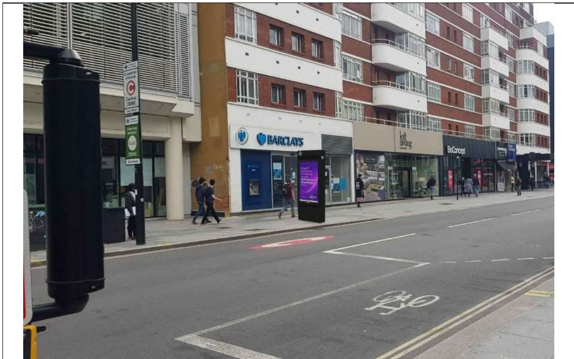
Image 2 - Photomontage