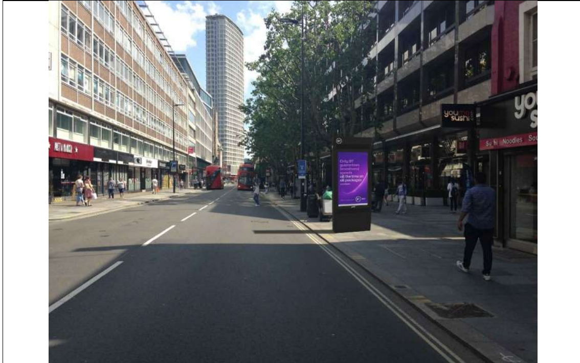
Image 2 - Photomontage