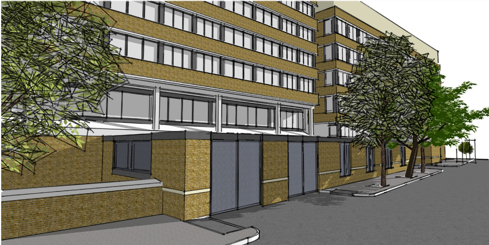
1 CGI UPPER END HEBRAND STREET NTS