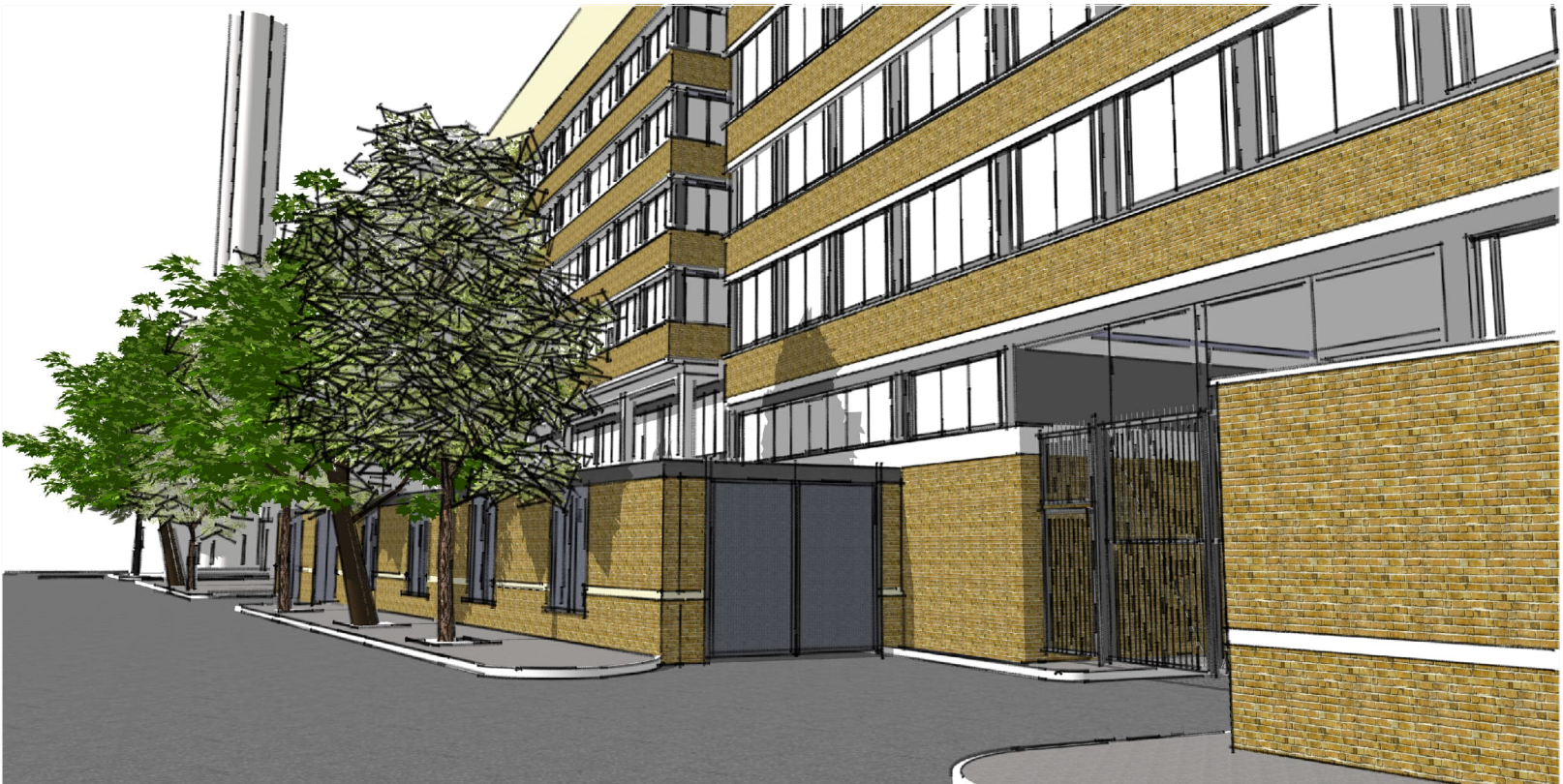
2 CGI LOWER END HEBRAND STREET NTS