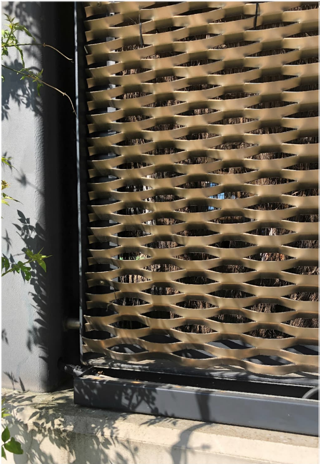
4 PROPOSED METAL LOUVRE SHEET Example of metal louvre in use NTS