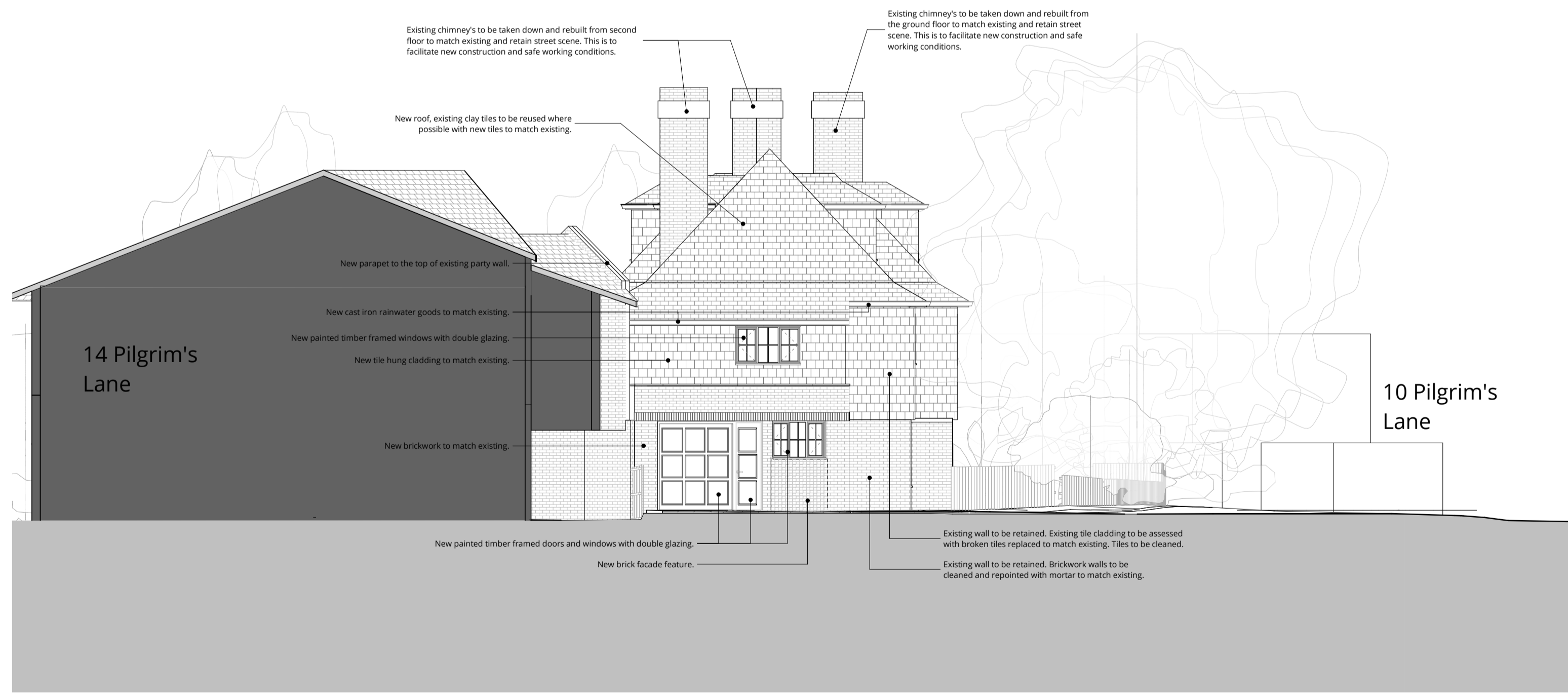
West Elevation - Proposed 1 : 100