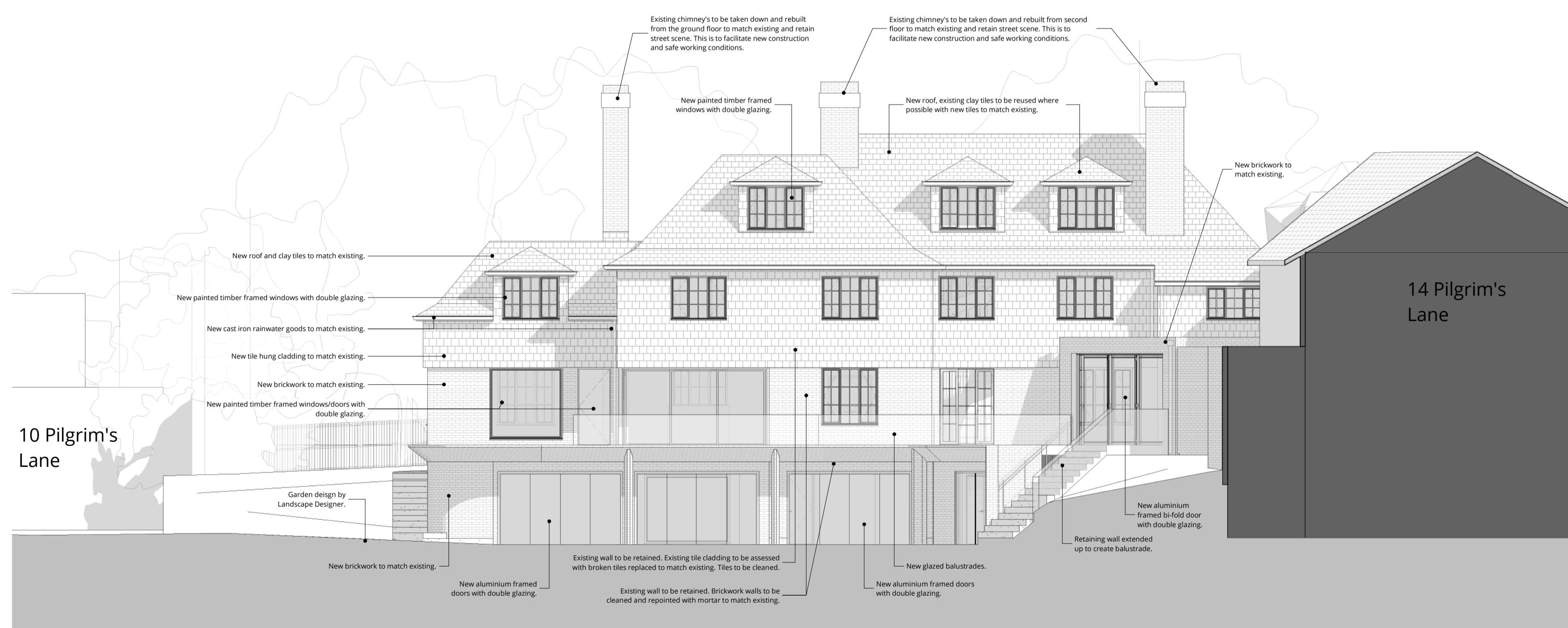
North Elevation - Proposed 1 : 100