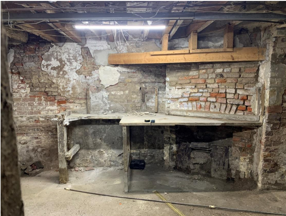
13. General basement view