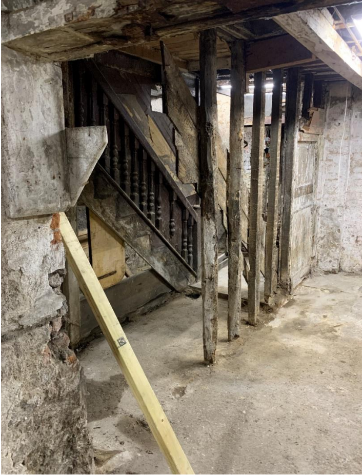
11. Remains of redundant staircase between basement and ground floor