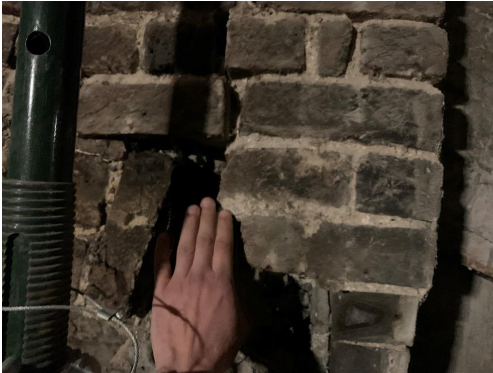
7. Fracture to chimney breast return prior to demolition