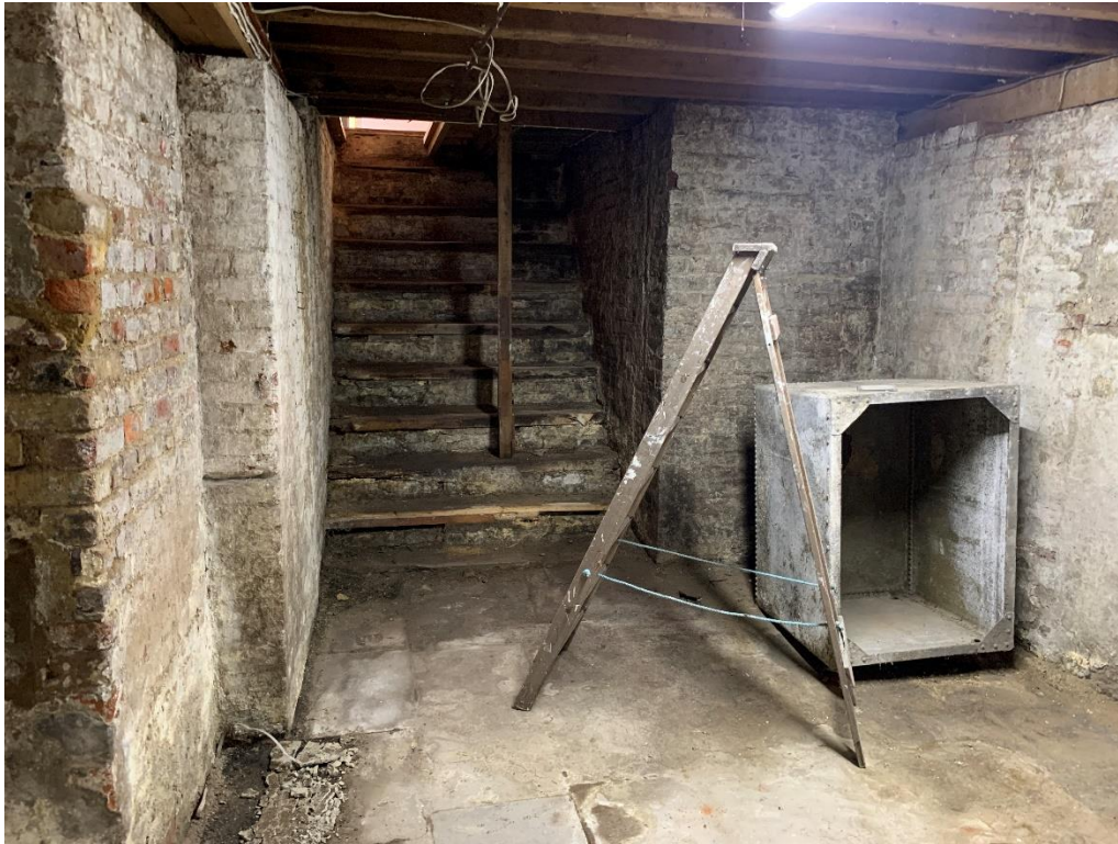
15. Timber tread / brick stair at basement level with access hatch to ground floor