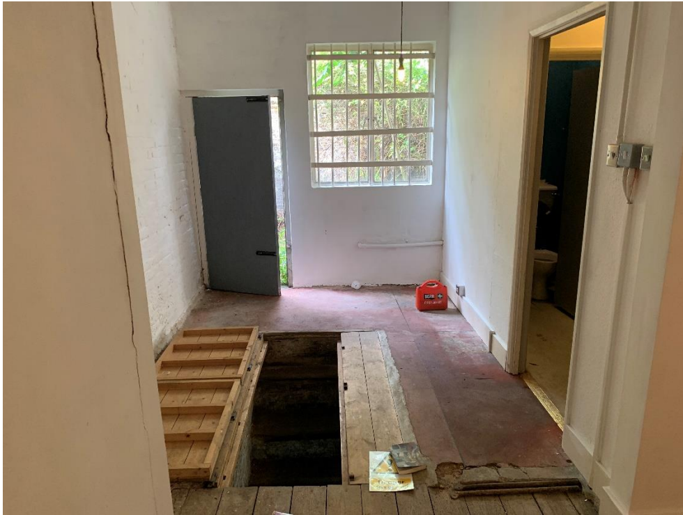
5. Rear part of shop, door to rear courtyard and WC and hatch to basement.