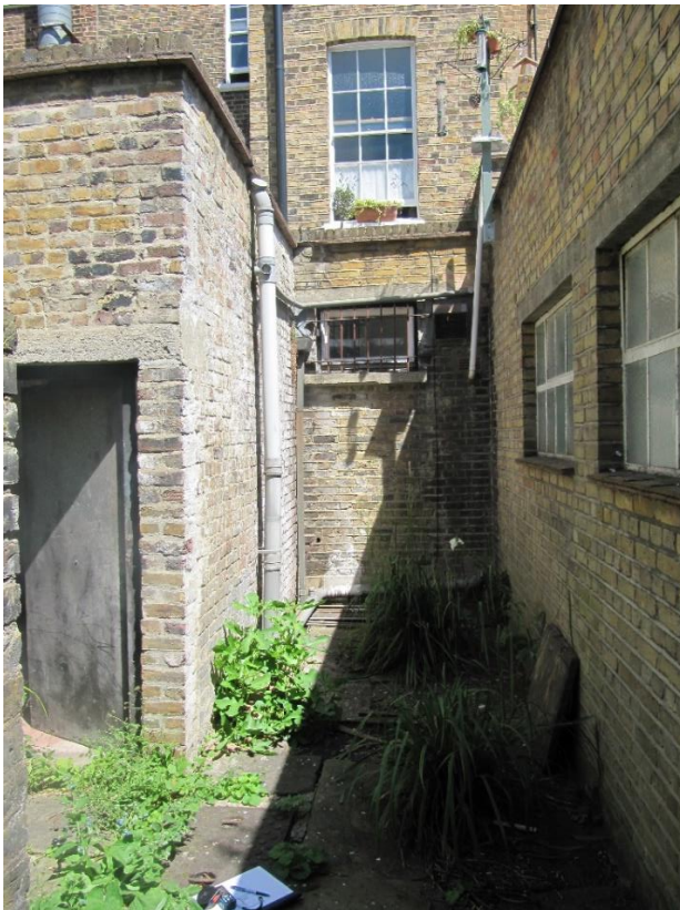
22. Rear Courtyard / rear addition