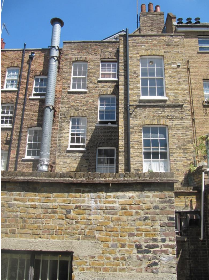
19. Main rear elevation above rear addition