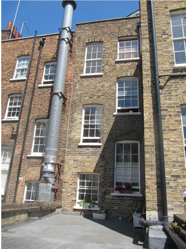
23. Flat roof over rear addition and main rear elevation