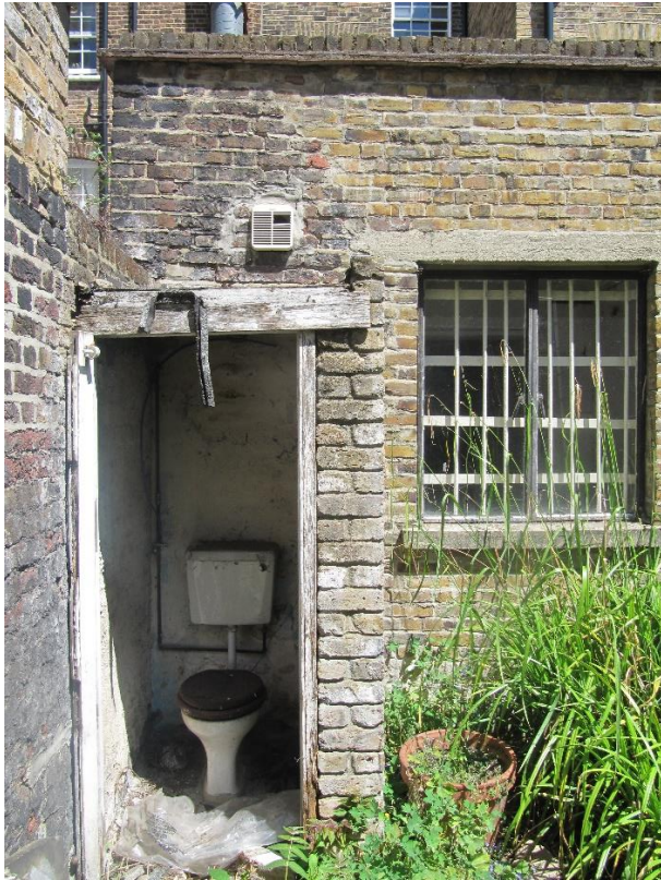
21. Disused external WC