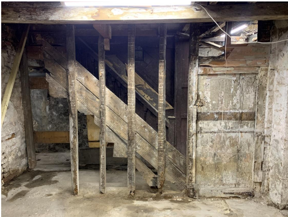
10. Remains of redundant staircase between basement and ground floor