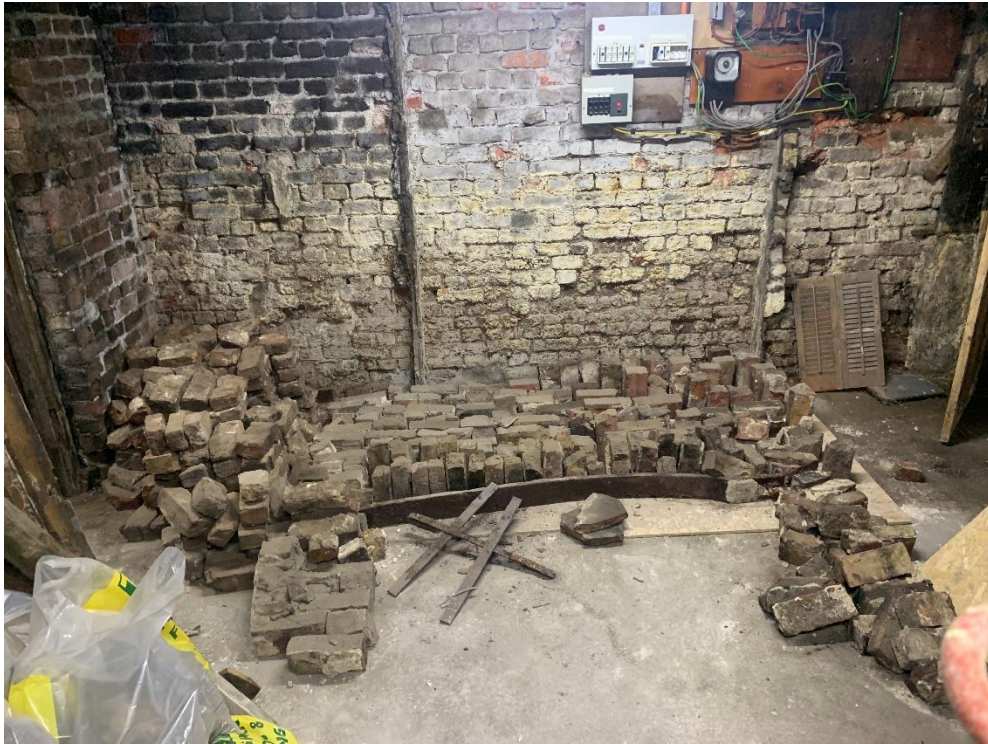
9. Salvaged brickwork from chimney breast