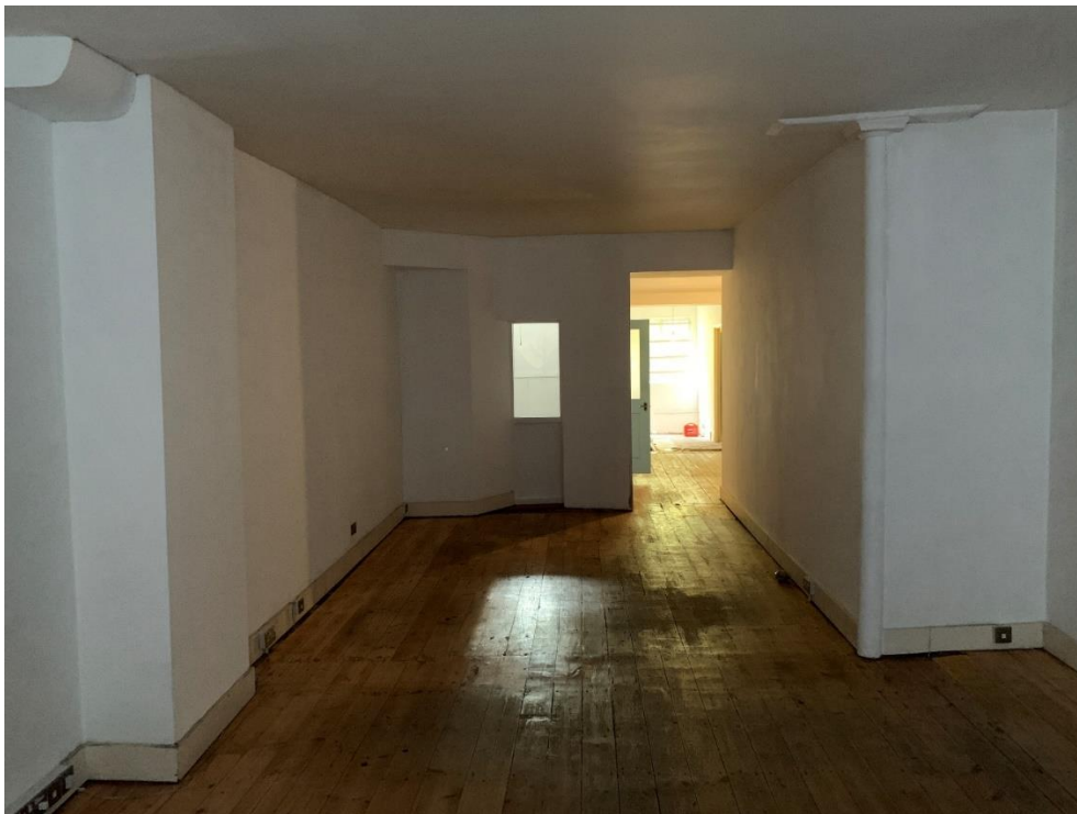
4. Ground floor facing towards rear - partition to right hand side adjoins common parts and is location where staircase is to be re-introduced.