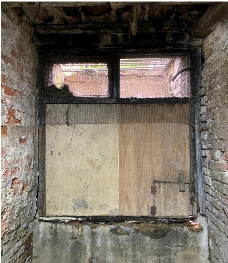
14. Rear lightwell window from inside basement