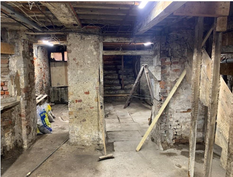
12. General basement view