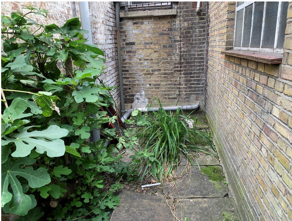
18. Rear Courtyard. Lightwell adjacent to rear elevation.