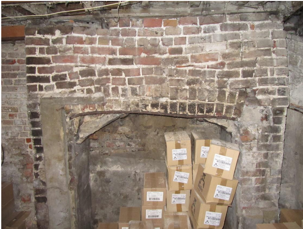
6. Basement chimney breast prior to demolition