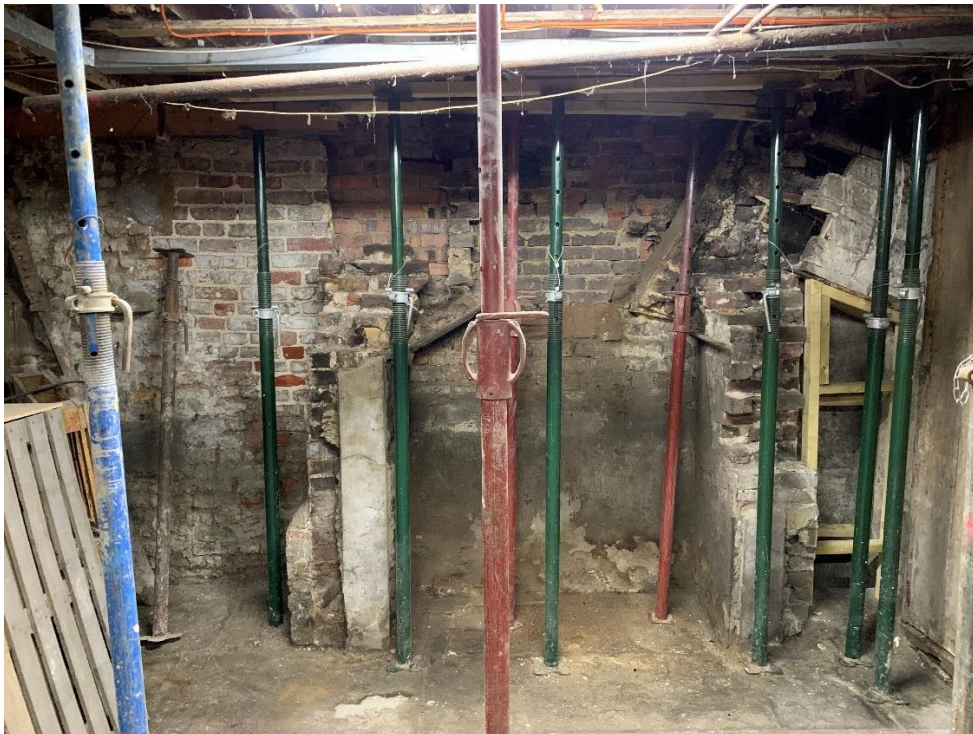
8. Basement chimney breast post partial demolition