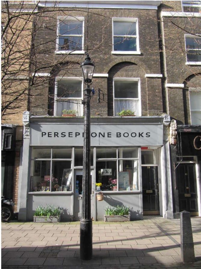
1. Front elevation (no works intended)