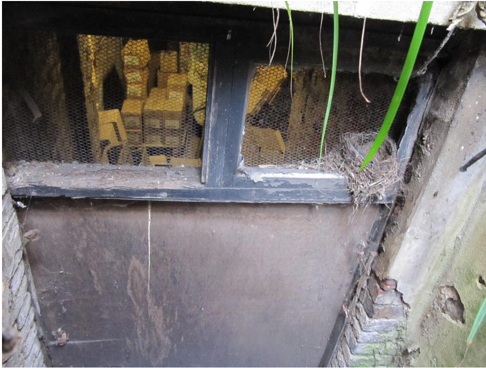
17. Rear lightwell window