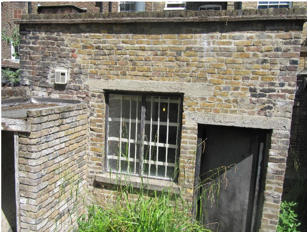
20. Rear addition rear elevation