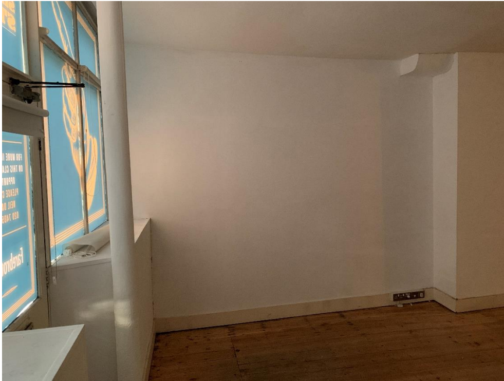
3. Party wall with No.57 (chimney breast no longer present)