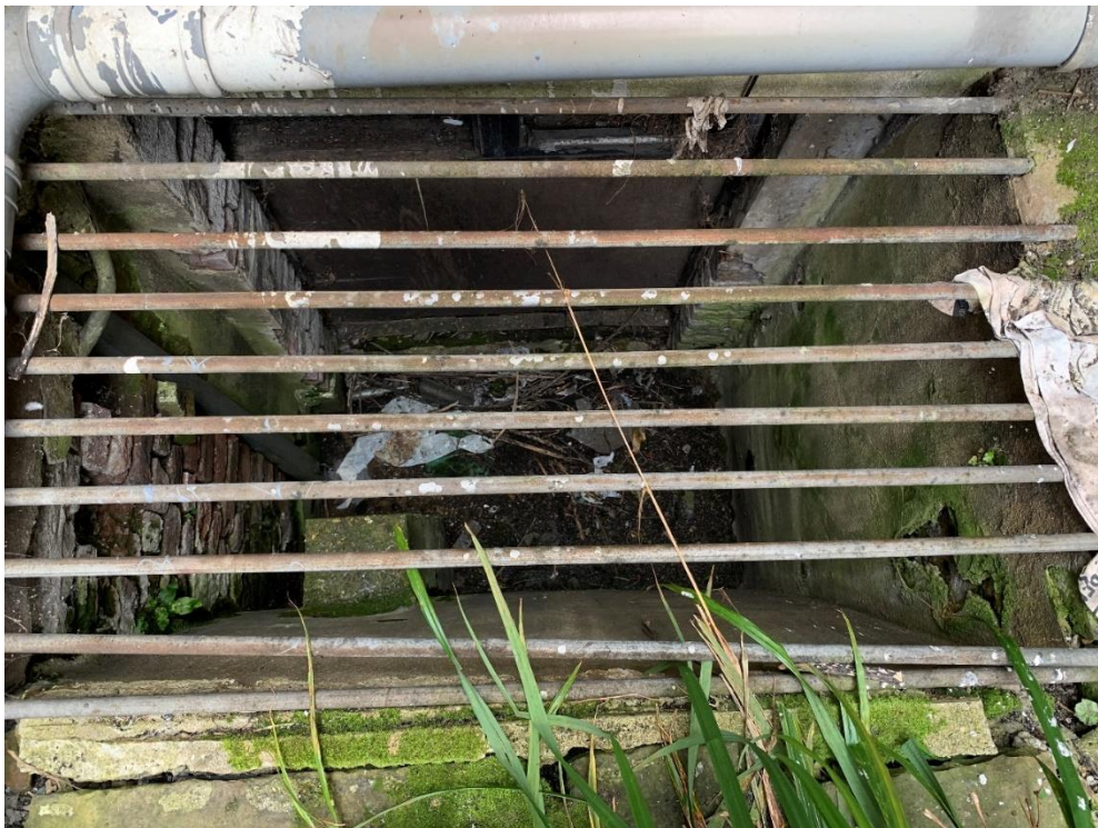
16. Rear Lightwell