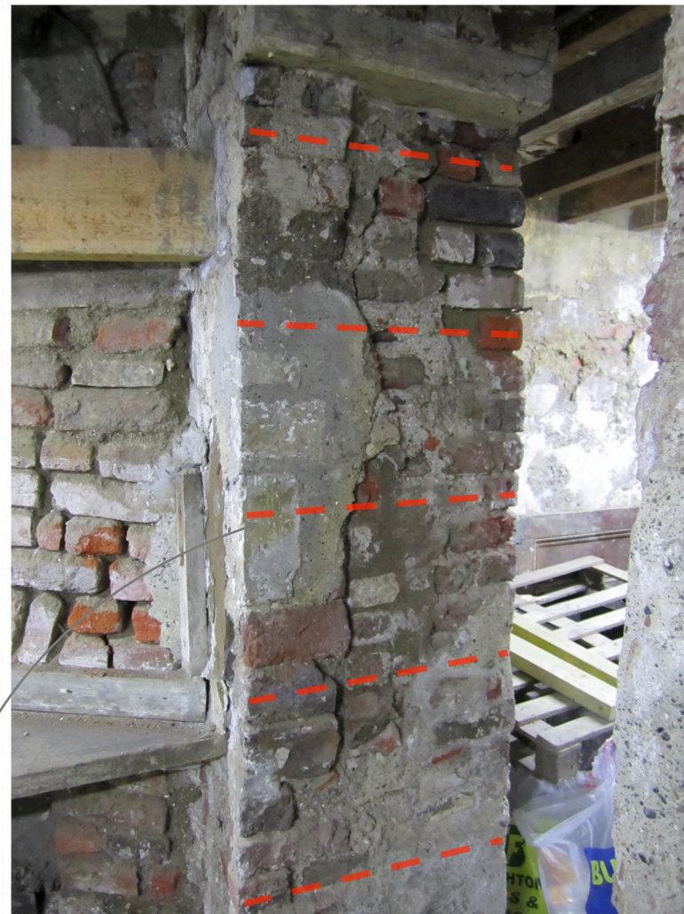
Masonry Stitching at End Section of Pier at Location 'M'