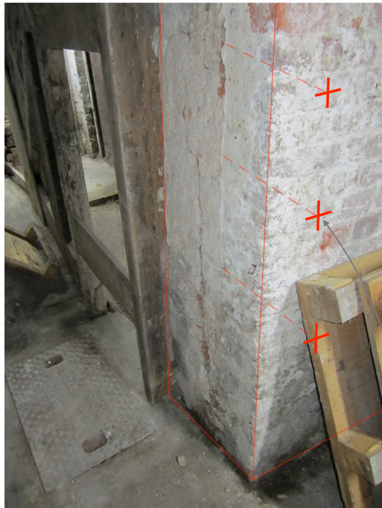
Masonry Stitching at Location 'V'