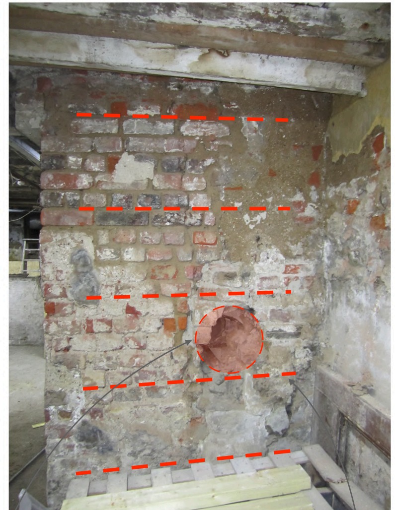
Crack Stitching at Location 'M'

Walls to be stitched using Helifix Cem Ties at 300mm vertical centres, for full height of the crack including the top and bottom. Ties to be located 175mm back from the end face of the wall. To be installed strictly in accordance with Helifix's recommendations. Holes to be made at mid-depth of bricks.