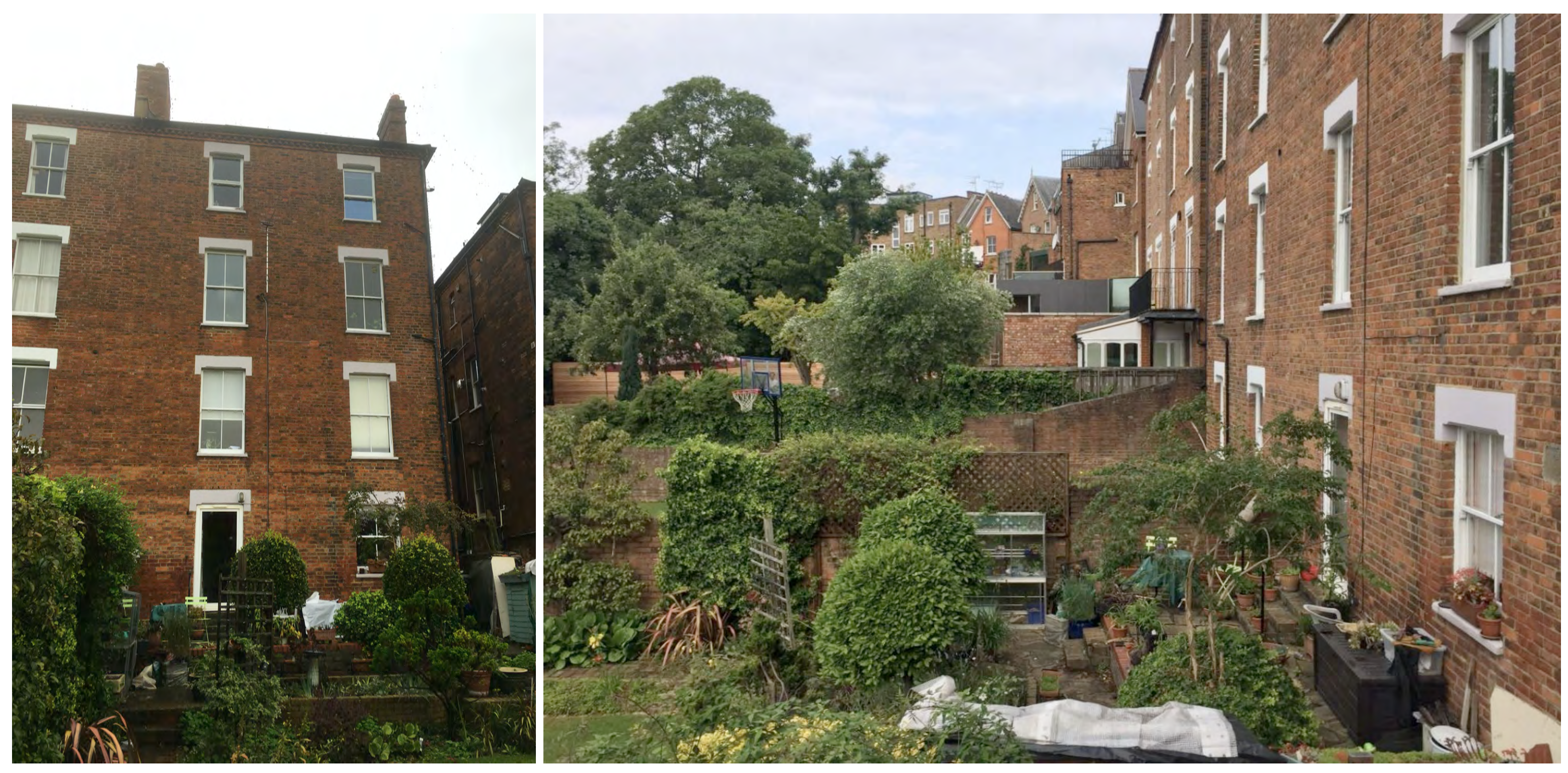
rear to 15 Nassington Road