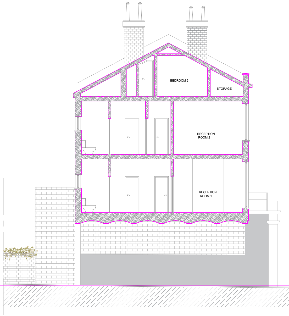
EXISTING SECTION A-A