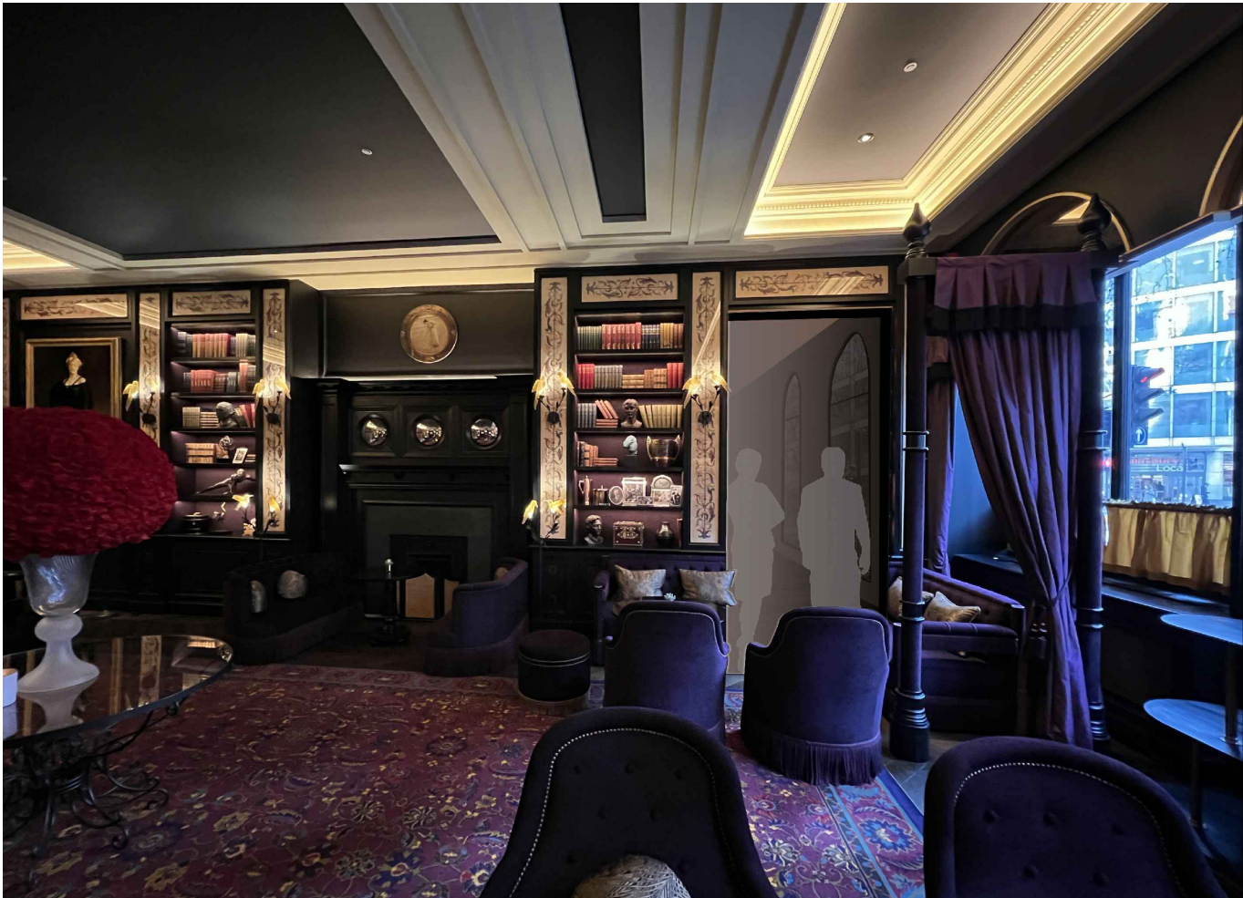
Proposed opening location to 118-120 High Holborn (blacked out area)

Client Michel Reybier Structural Engineer Services Engineer Consultant