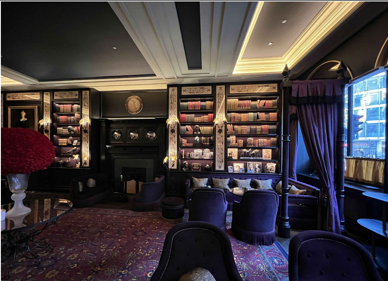
Existing L'oscar Ground floor