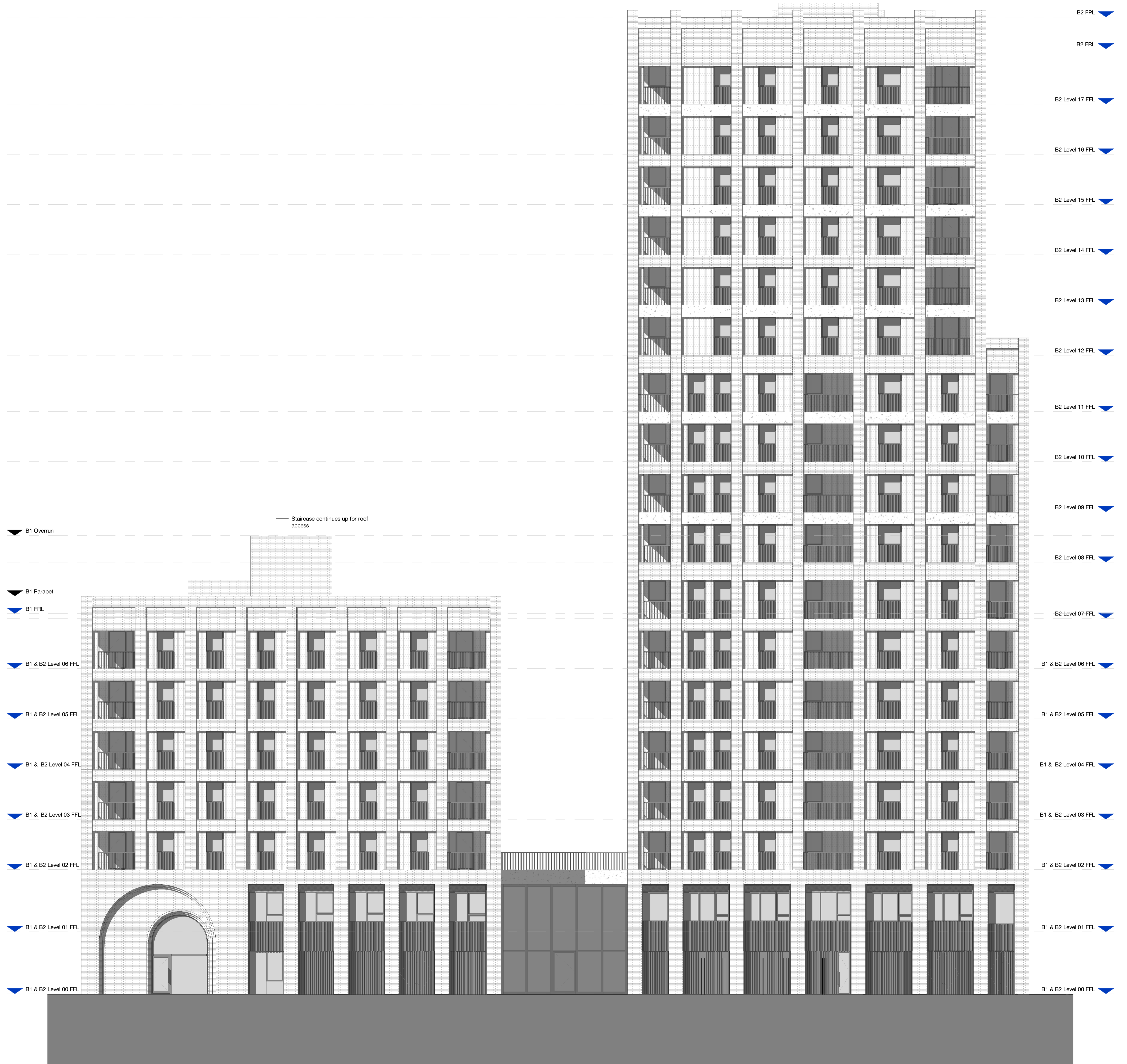
1 South Elevation 1 : 100