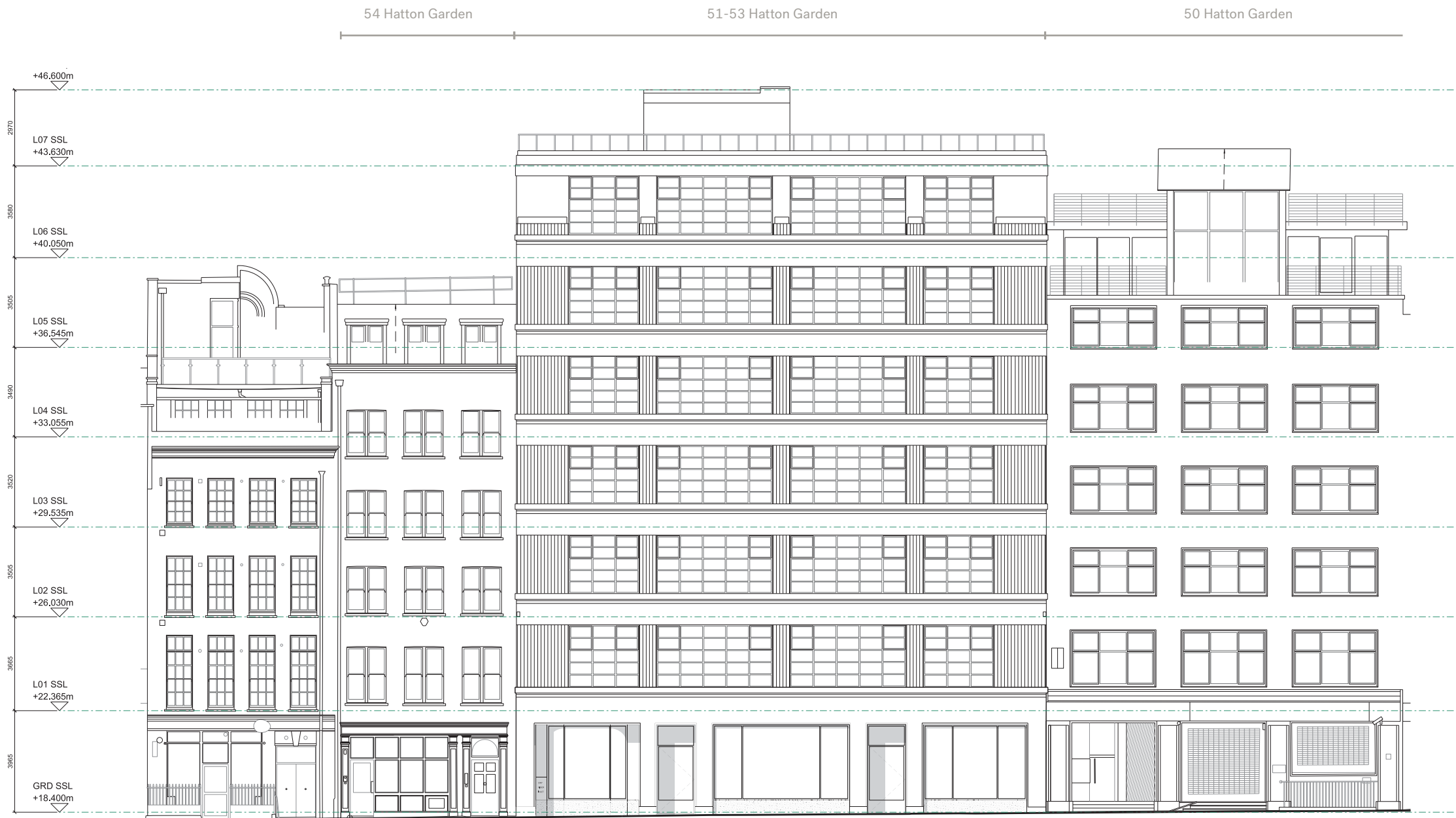
5.6 PROPOSED STREET ELEVATION 1:200

Piercy&Company accepts no liability for either: any such alterations and/or additions to the background information by others; or any other changes made by others to the architectural content of the background information itself.