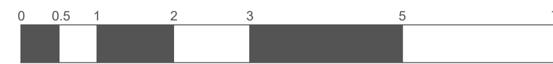
Scale Bar 1:50 (m)