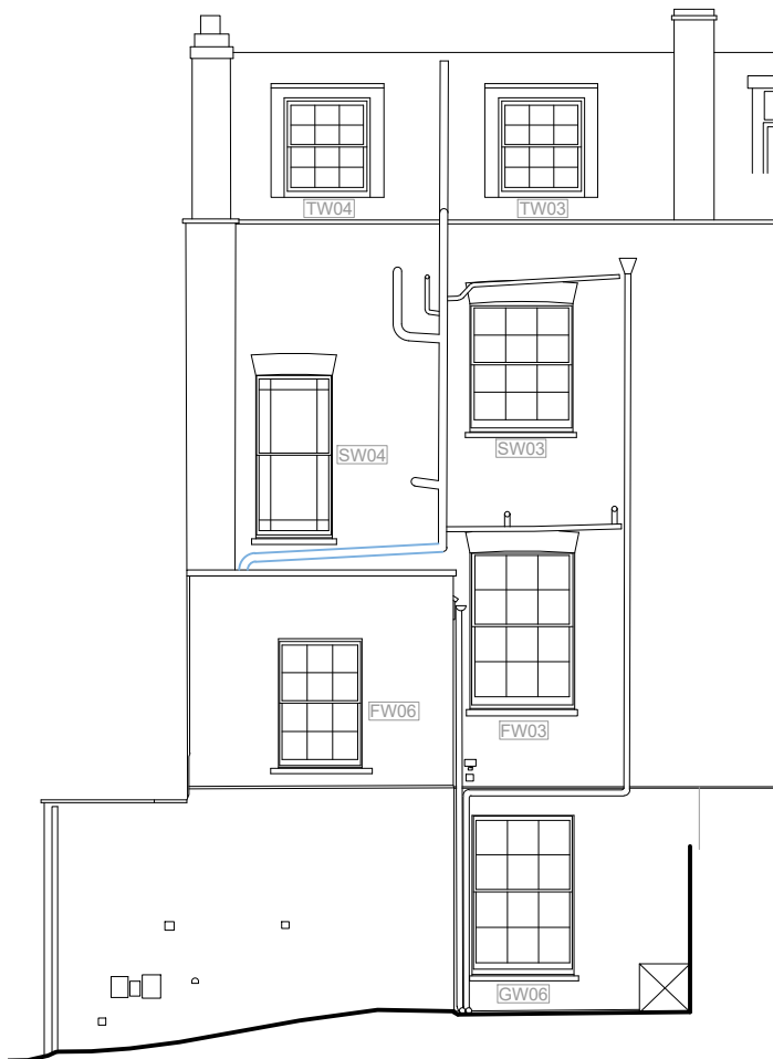
03 East Elevation 2200 1:100 @ A3