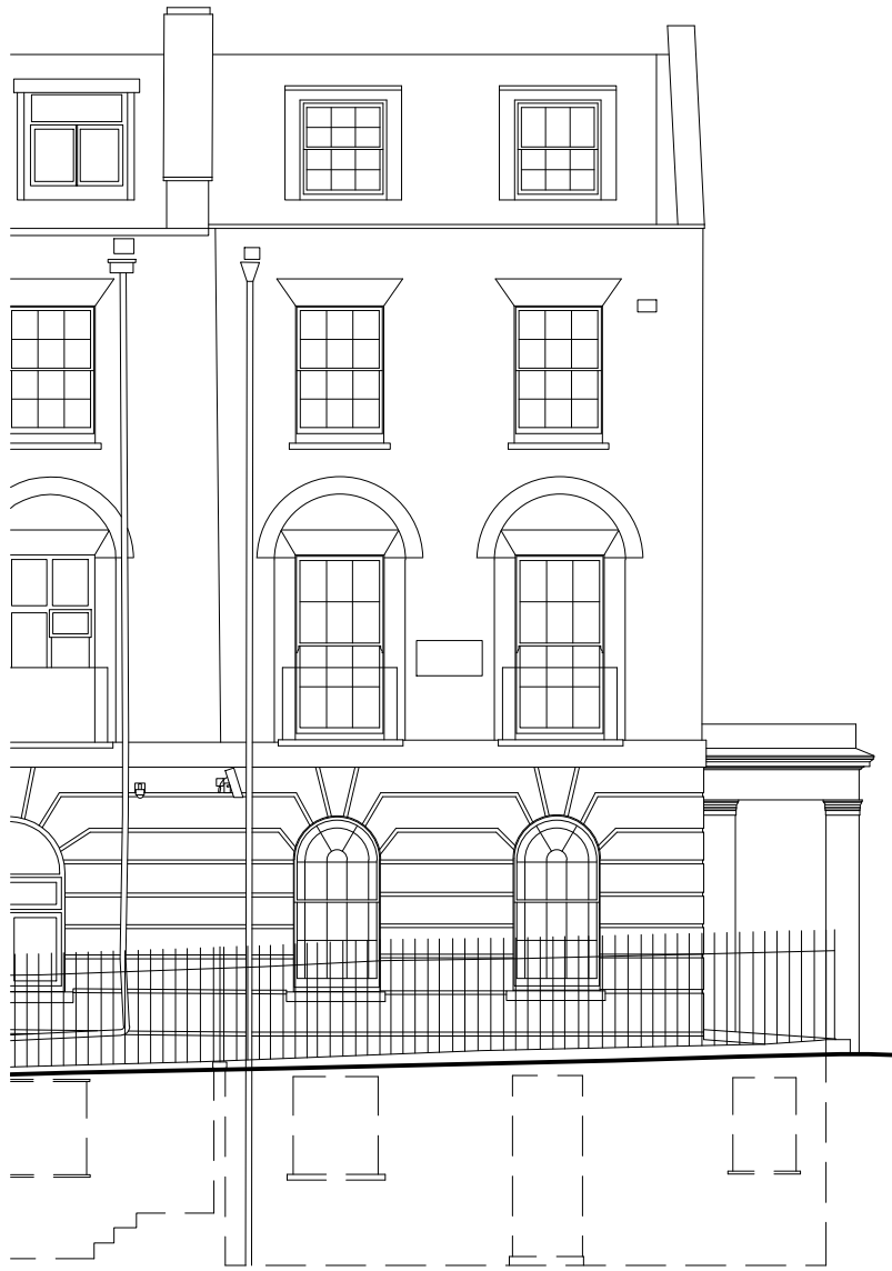
01 West Elevation 1200 1:100 @ A3