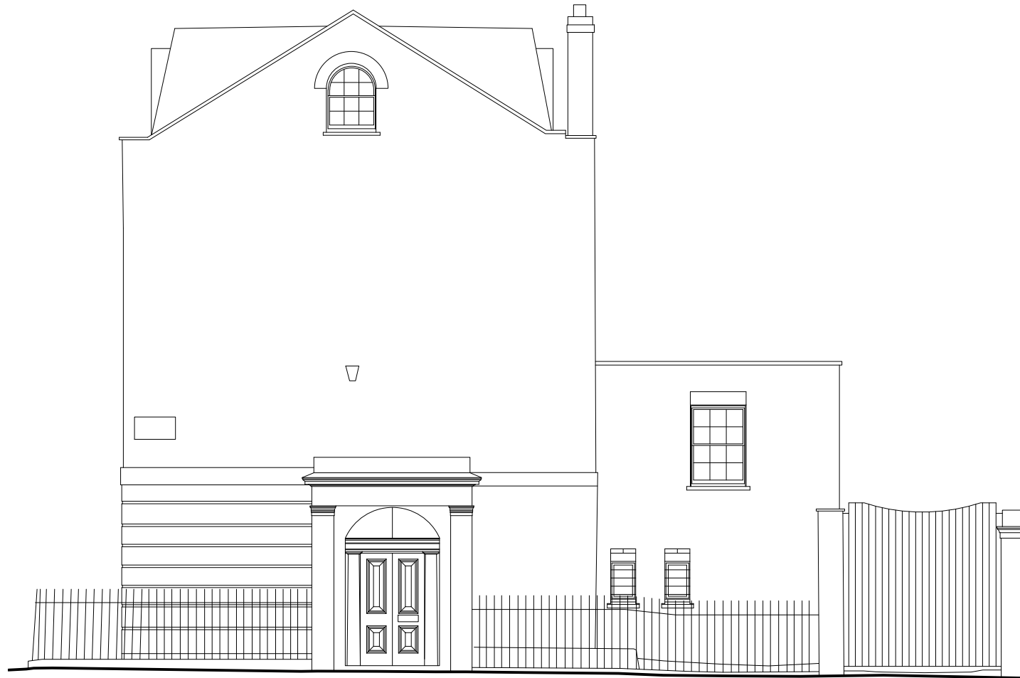
02 South Elevation 1200 1:100 @ A3