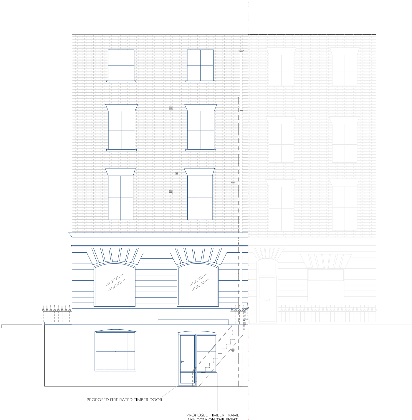
PROPOSED FRONT ELEVATION INC BASEMENT - TOTTENHAM STREET