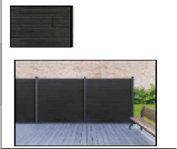
Dura Cladding Flush Resist Board 150x18 DARKGrey 3660mm FR B-s1