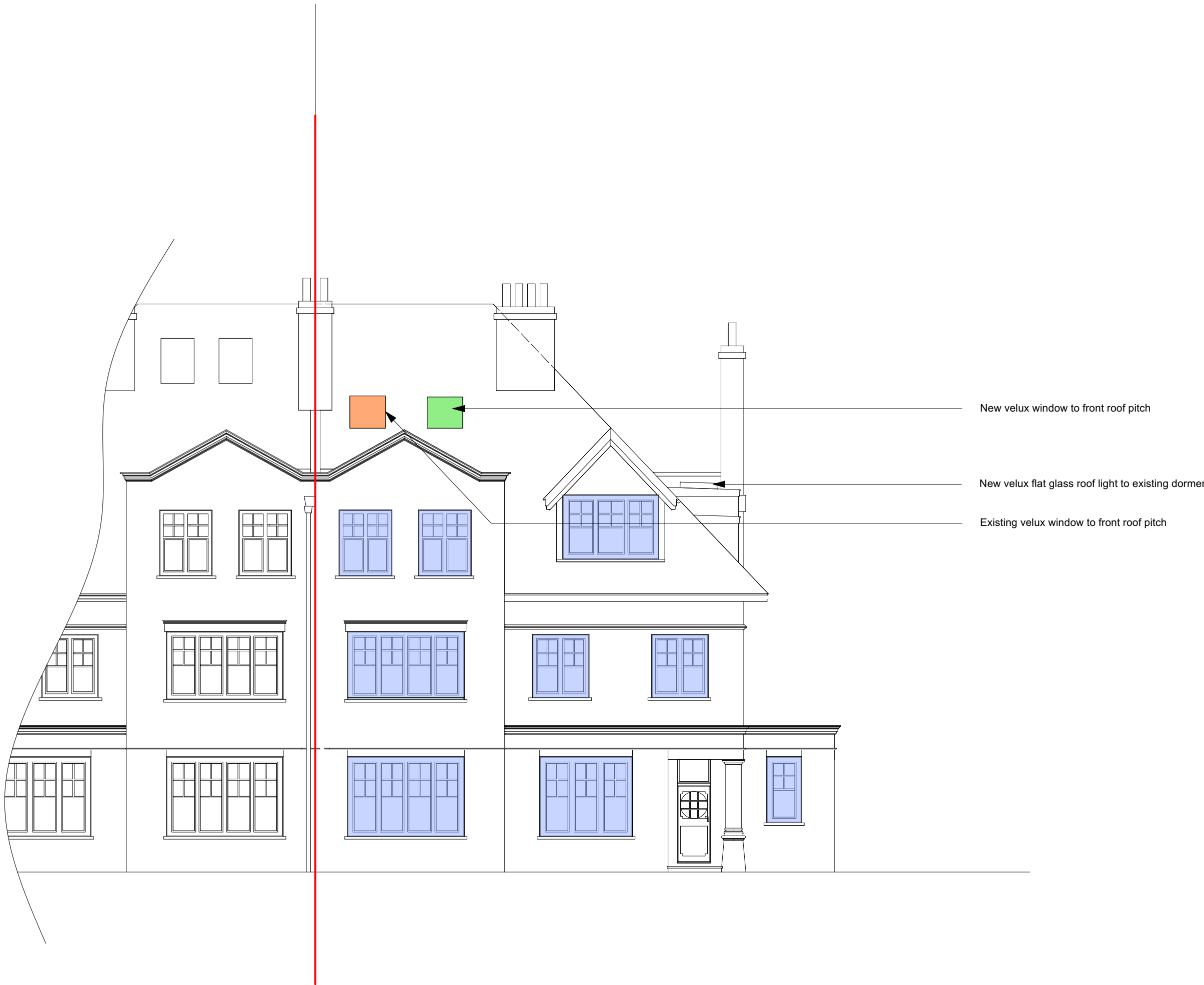
Proposed South elevation

In the event of any detail or dimensional conflict between Charlton Brown Architects drawings, the matter must be referred back to Charlton Brown Architects for clarification