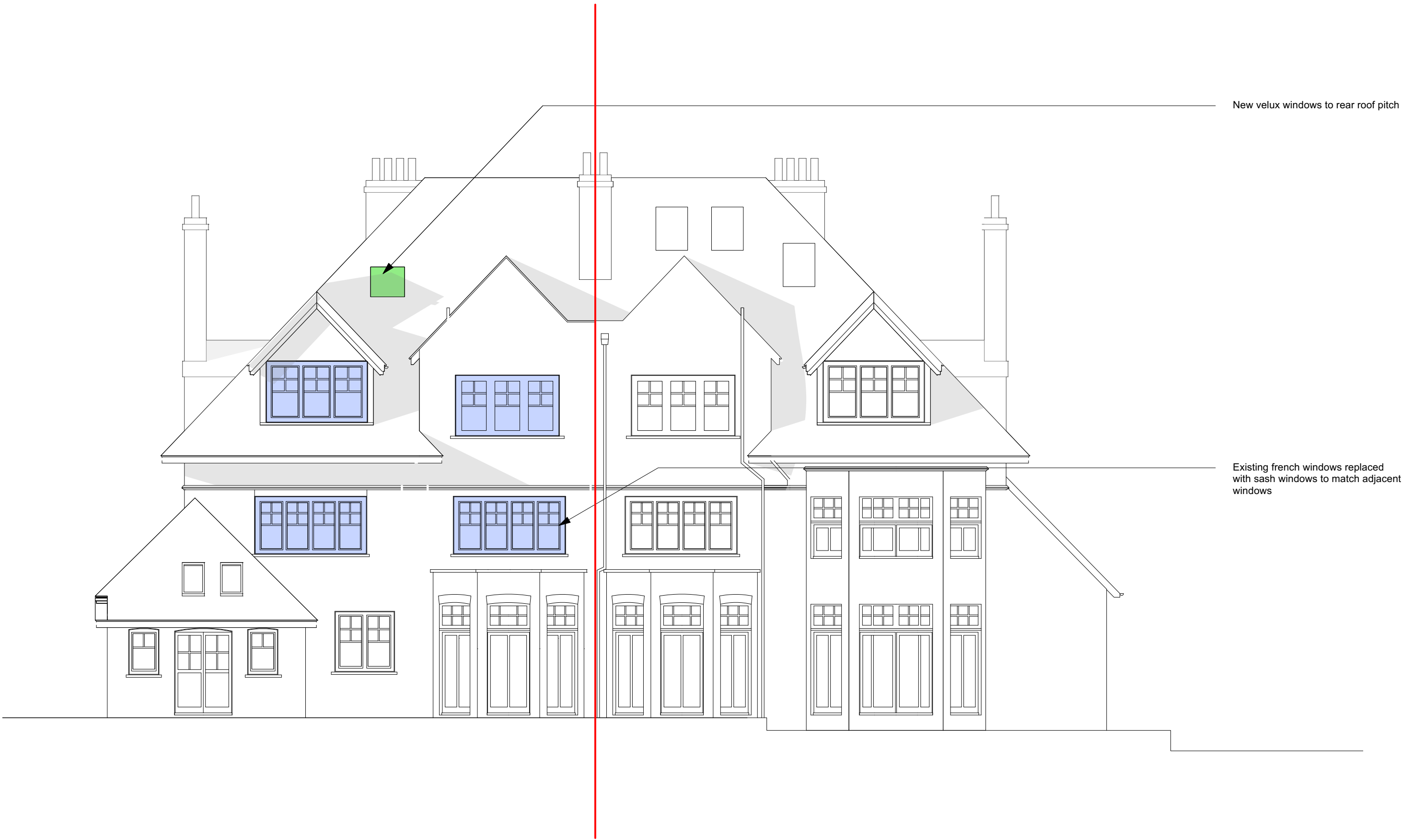
Proposed North elevation

Project Number Drawing Number Revision 20086 AP04