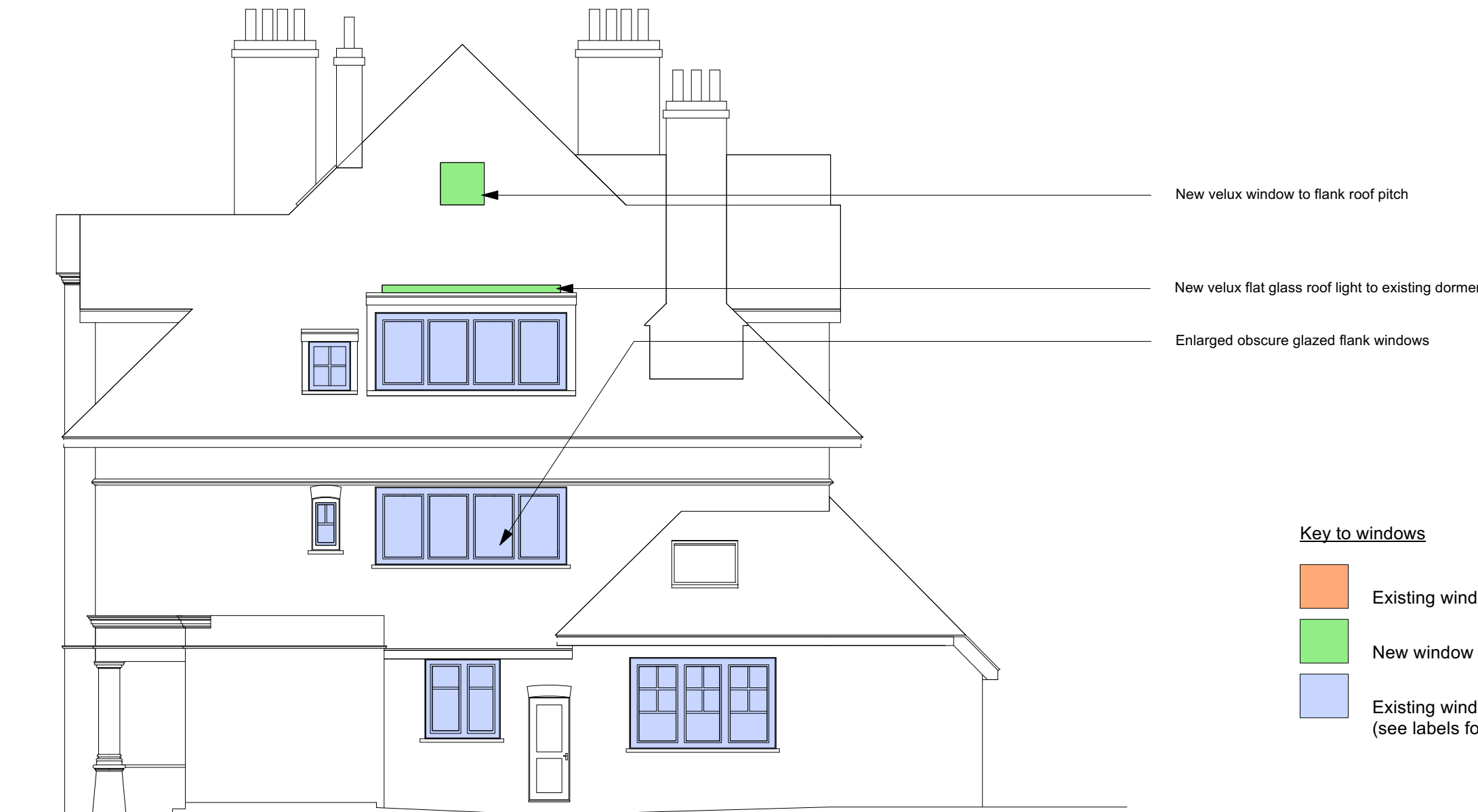
Proposed East elevation