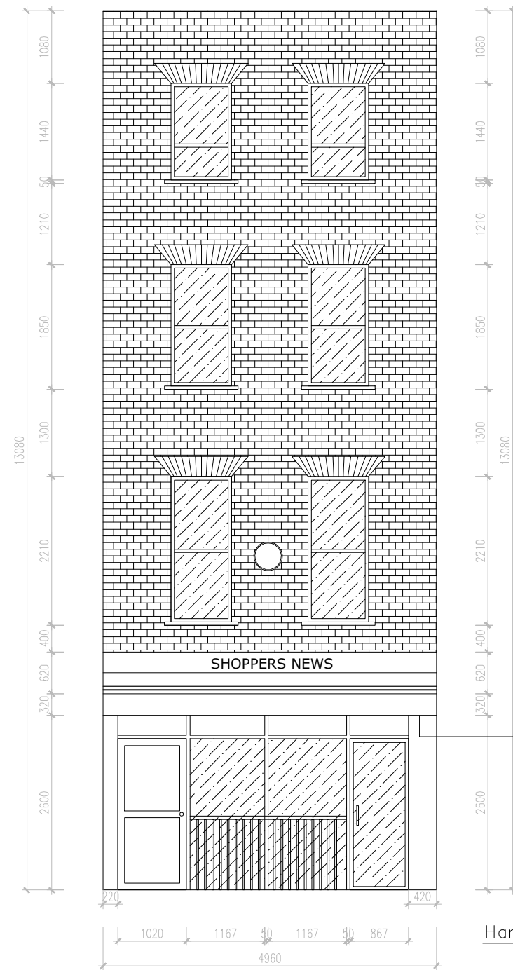
EXISTING FRONT ELEVATION scale 1/100