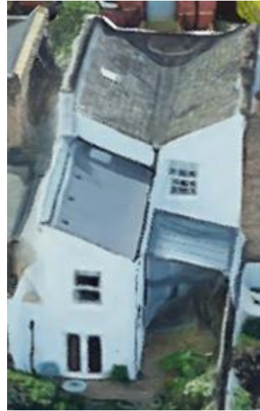
Fig. 2 Rear Elevation: No. 12 Willes Road