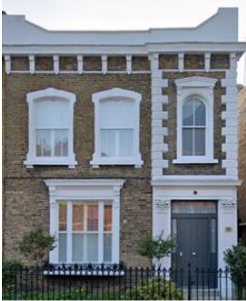
Fig. 1 Front Elevation: No. 12 Willes Road

Project Title: No. 12 Willes Road, London NW5 3DS Date: June 2022 Project Ref: 21-651-DA-PL2-001 Document: Design and Access Statement