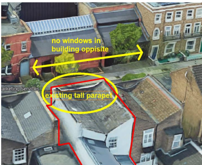
Fig. 3 Rear Elevation: siting and context

The proposal has significantly reduced in scale and massing.