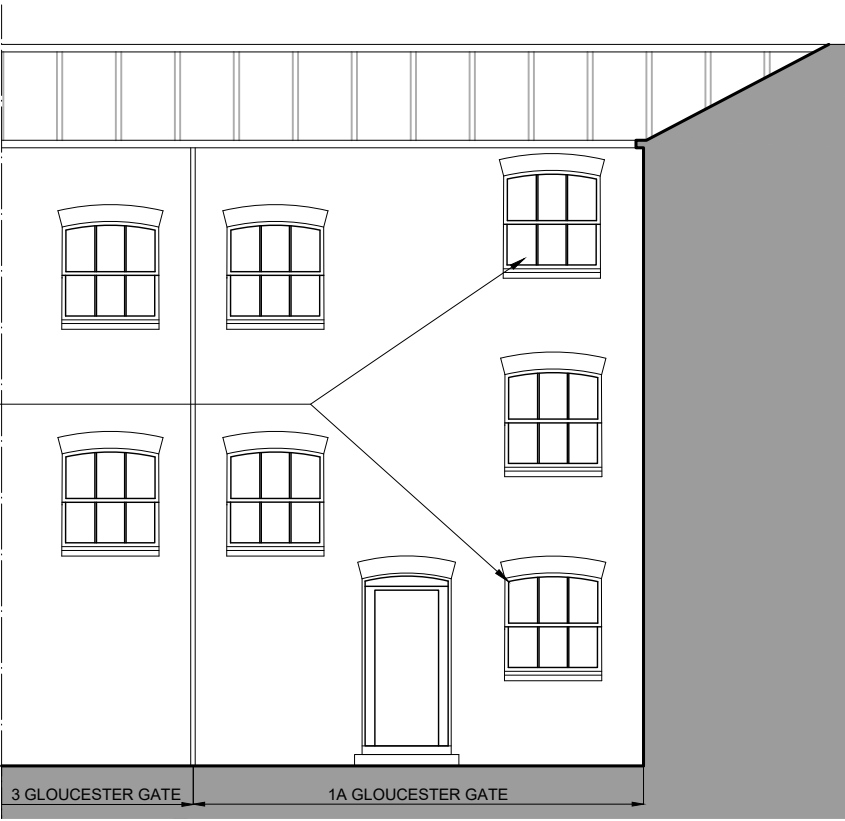
PROPOSED ELEVATION B GLOUCESTER MEWS ELEVATION scale 1:100