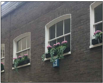
New Sash Windows Traditional sliding box sash. Double glazed white painted timber with lamb's tongue glazing bar to match existing.