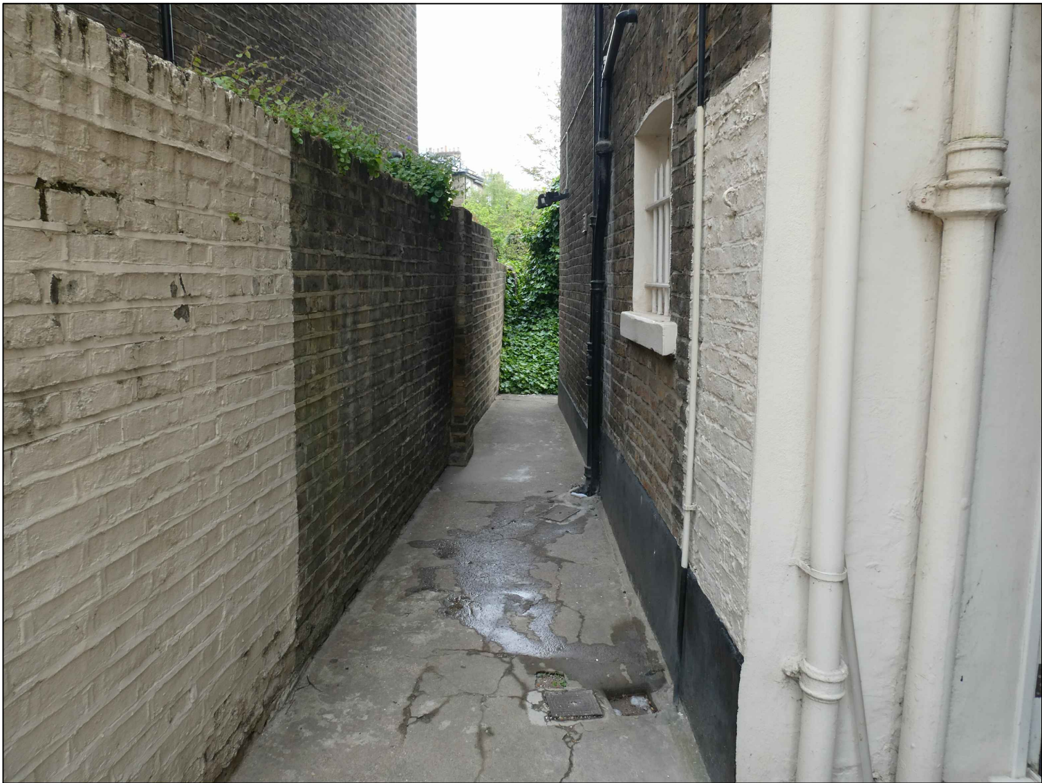
PHOTO-06_EXISTING SIDE ELEVATION -ACCESS TO FLAT 4a LOWER GROUND FLOOR, BELSIZE PARK.