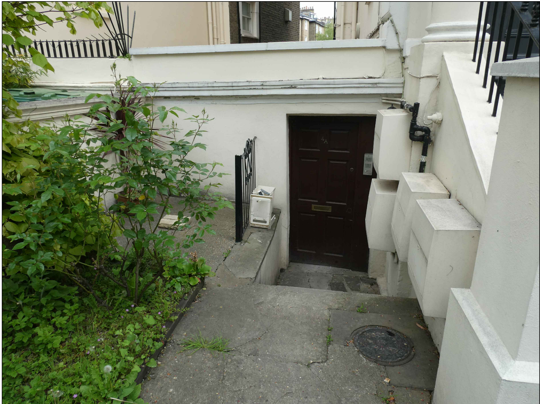
PHOTO-02_EXISTING ACCESS TO FLAT 4a LOWER GROUND FLOOR, BELSIZE PARK