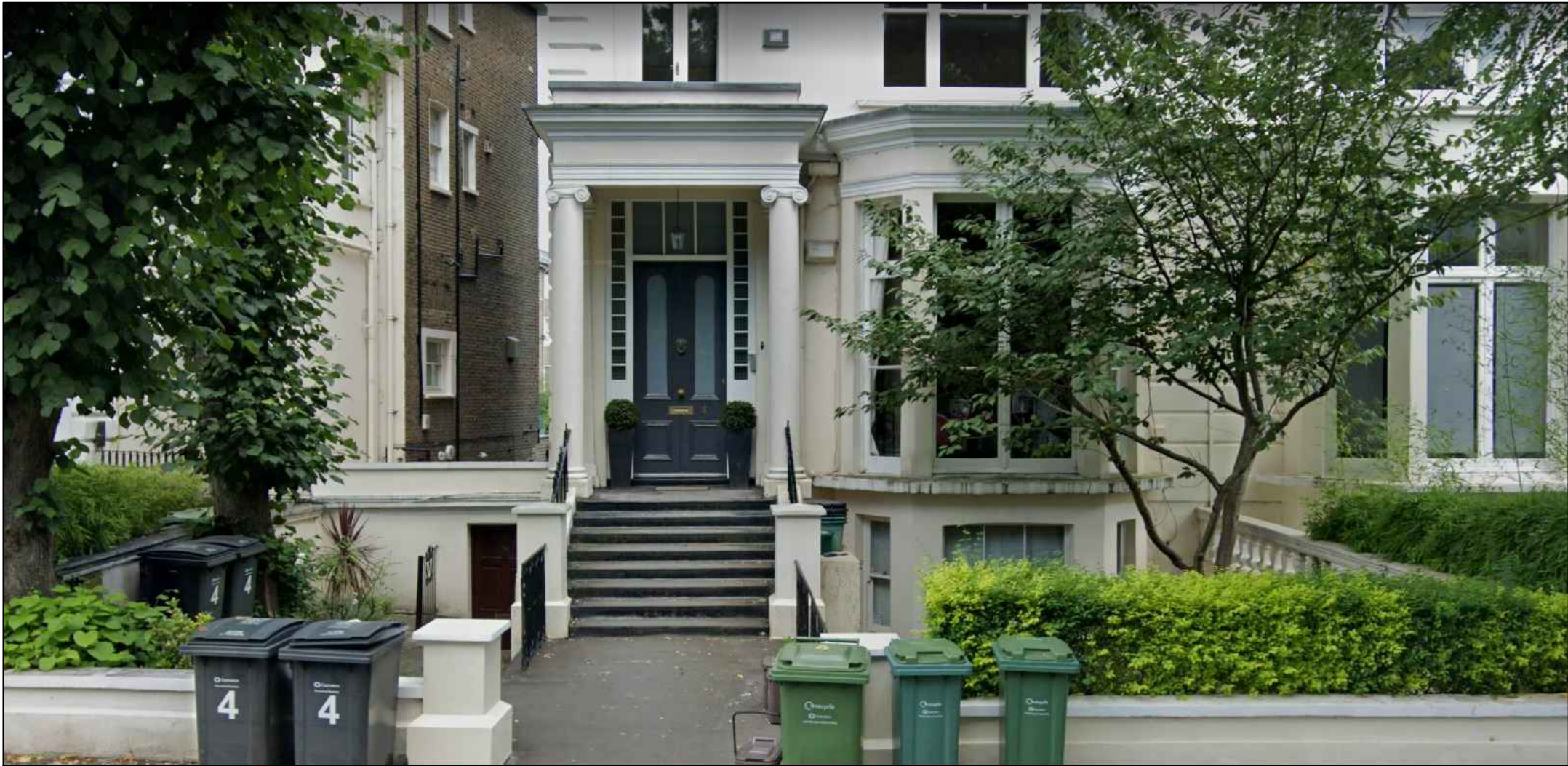
PHOTO-07_EXISTING FLAT 4a LOWER GROUND FLOOR FRONT ELEVATION.