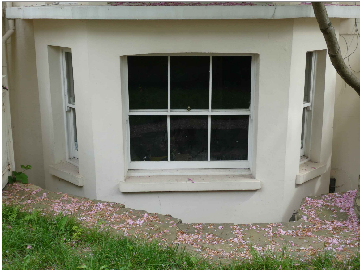
PHOTO-03_EXISTING TIMBER SASH WINDOWS AT THE LOWER GROUND FLOOR