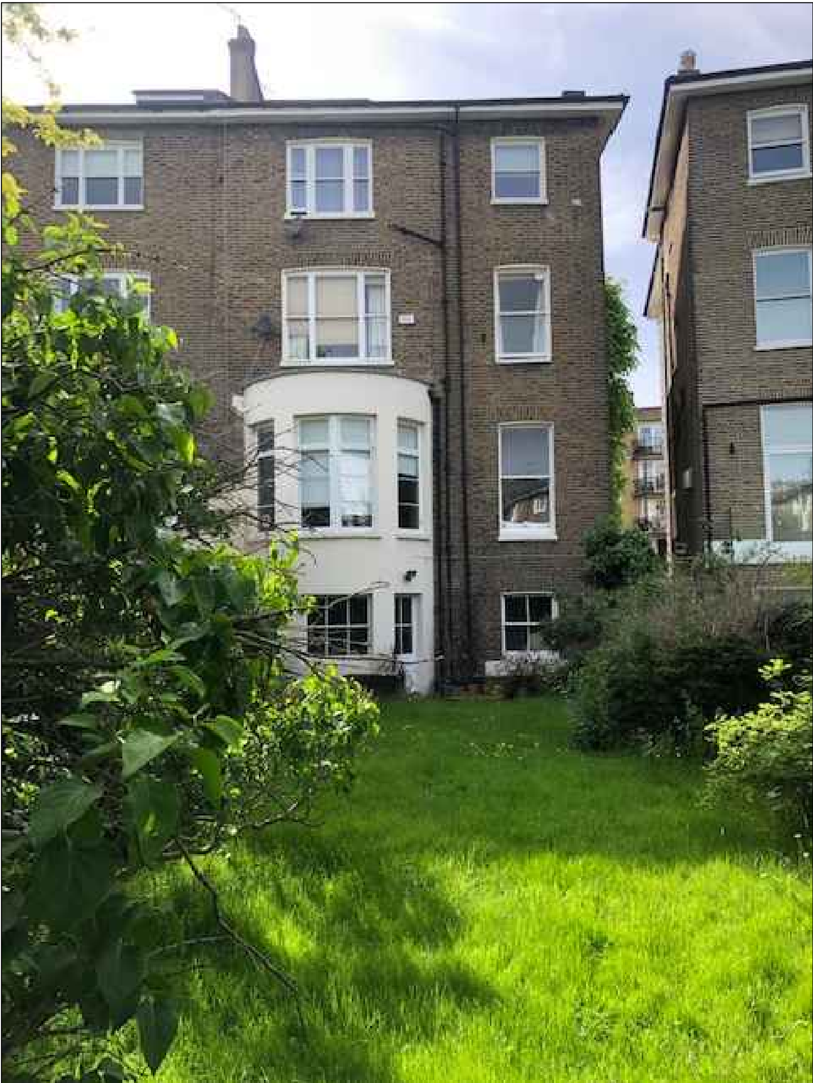
PHOTO-04_EXISTING REAR ELEVATION