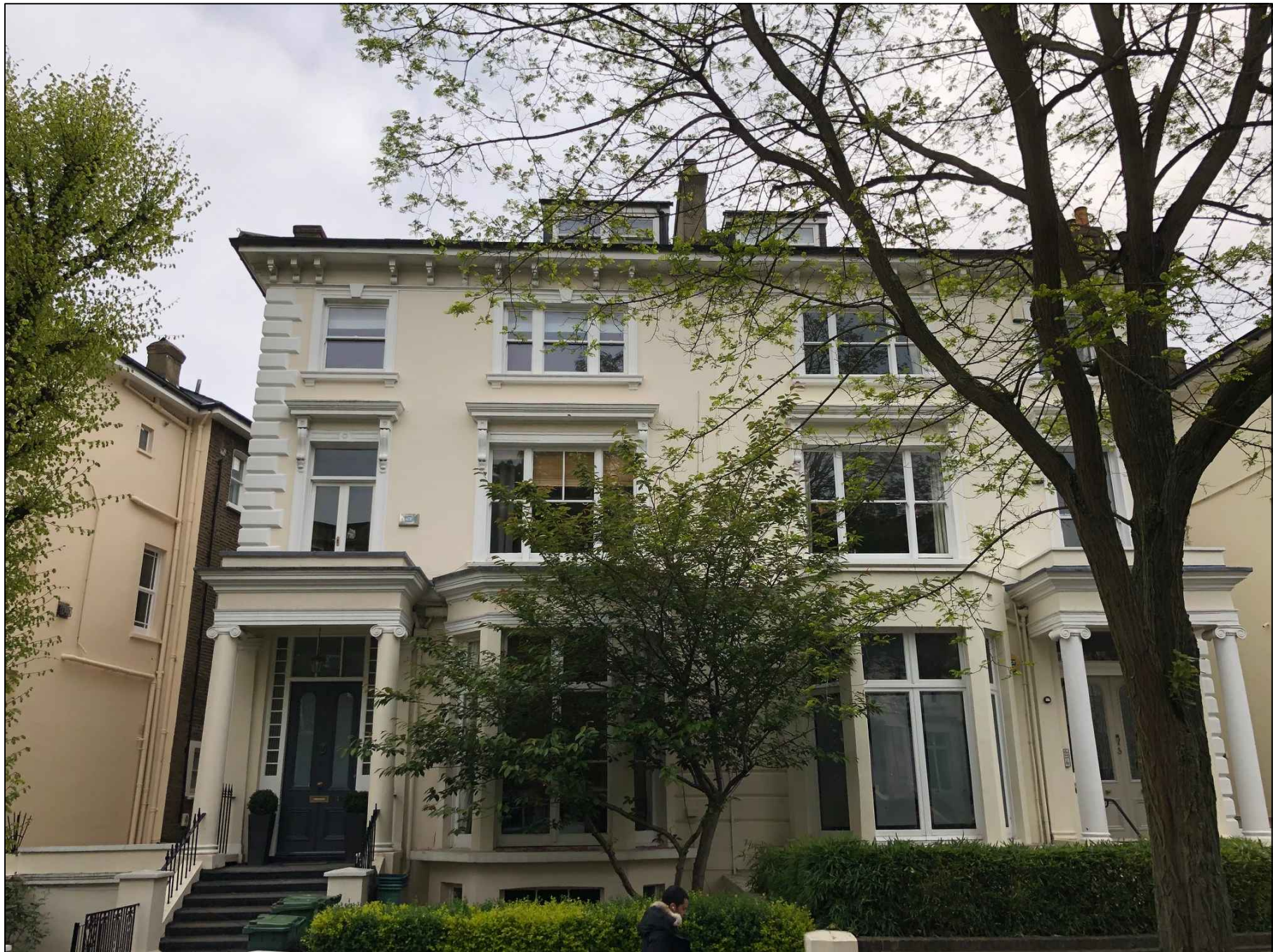
PHOTO-01_EXISTING FRONT ELEVATION