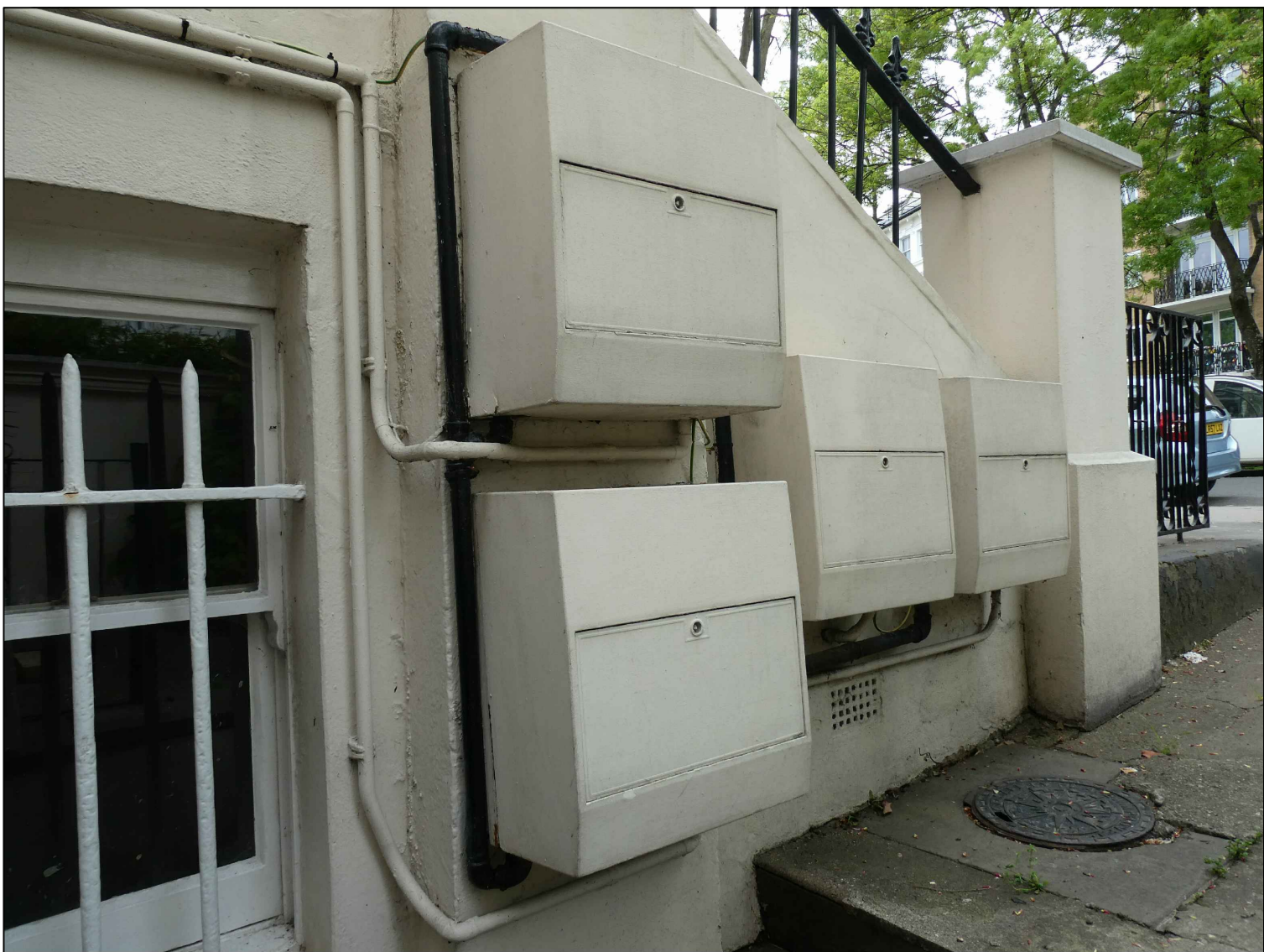
PHOTO-08_EXISTING SIDE SASH WINDOW WITH SECURITY METAL BARS.

NOTES This drawing is intended for the use of the individual or entity to whom it is addressed. You are hereby notified that any dissemination, distribution or copying of this drawing is strictly prohibited. 1. All dimensions and levels to be checked on site. The Architect to be notified of any discrepancies. 2. This drawing to be read in conjunction with the other relevant project drawings and in addition, with structural, M & E engineers, approved sub-contractors drawings and current instructions. 3. All work to be undertaken with the requirements of the current Building and Water Regulations.