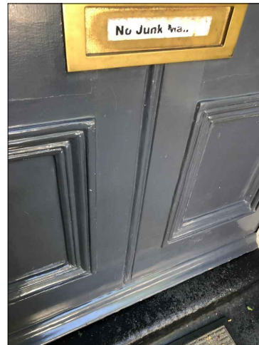
5 EXT. BLOCK ENTRNACE DOOR PHOTO ( RAL 7024 TBC) 124 Scale NTS @A3