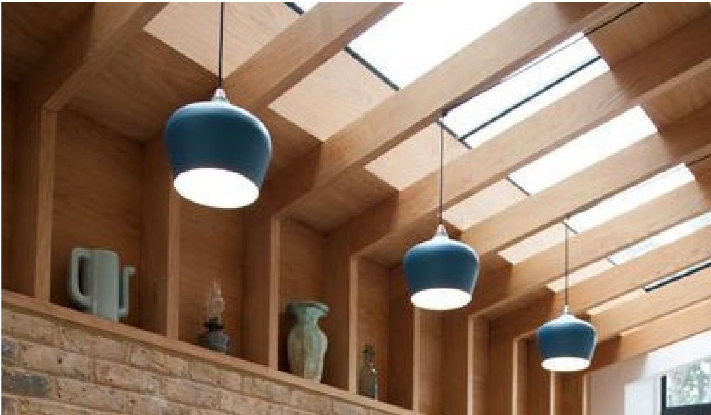
04 Rooflight Louvre President PLDI-1.01