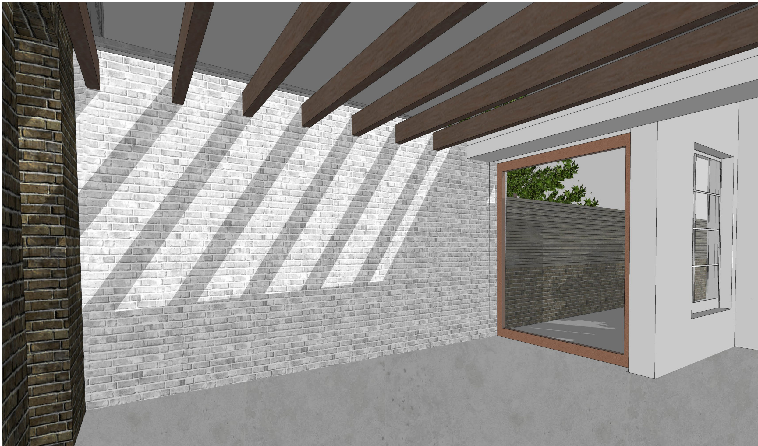
03 Rooflight Louvre Impression PLDI-1.01