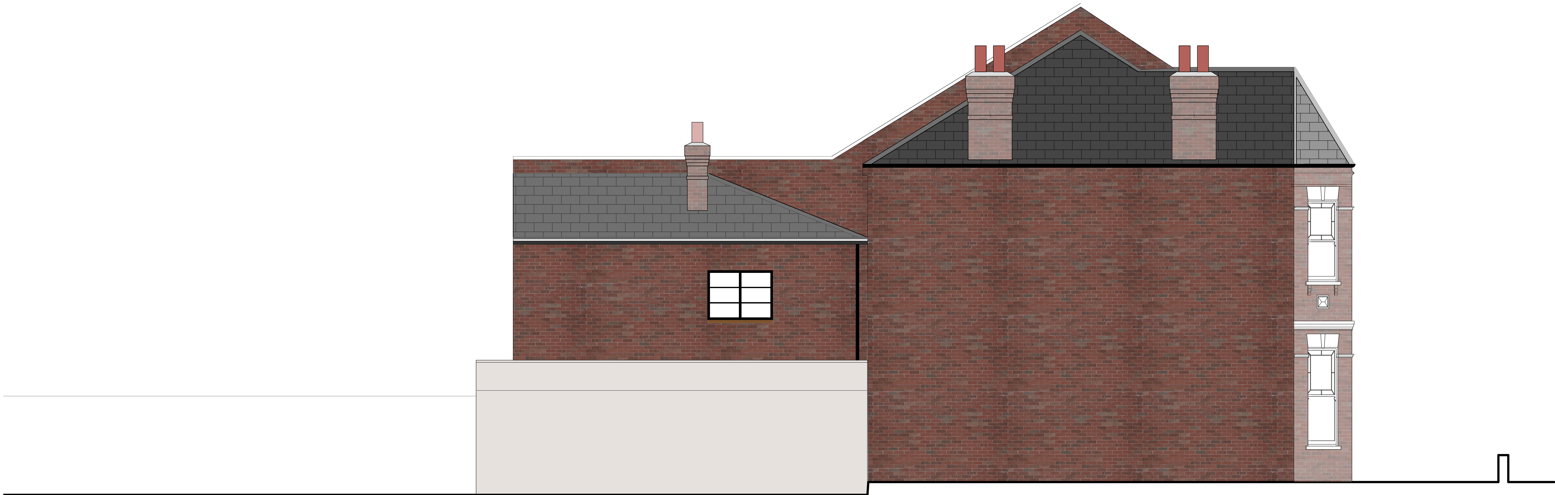
03 Existing Side Elevation

Information contained within this drawing is the sole copyright of NMA Studio Ltd. and is not to be reproduced without express permission. No implied licence exists. This drawing not to be used for land transfer or valuation purposes. Do not scale from this drawing. All dimensions & levels are to be checked on site by the contractor. Issued for purposes indicated only. Drawing errors and omissions to be reported to the architect.