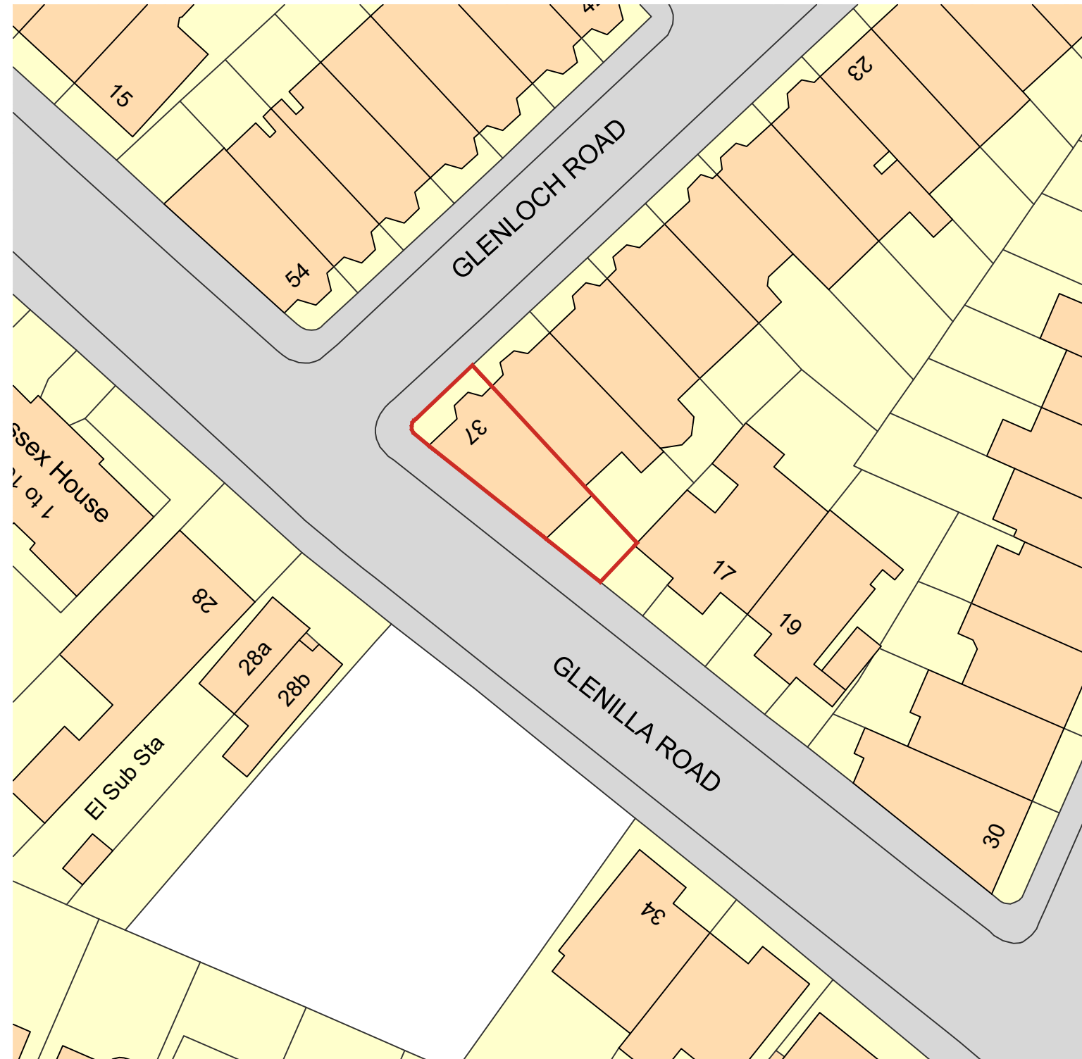
BLOCK PLAN Scale @1:500