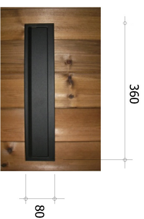
Rear Locakable box