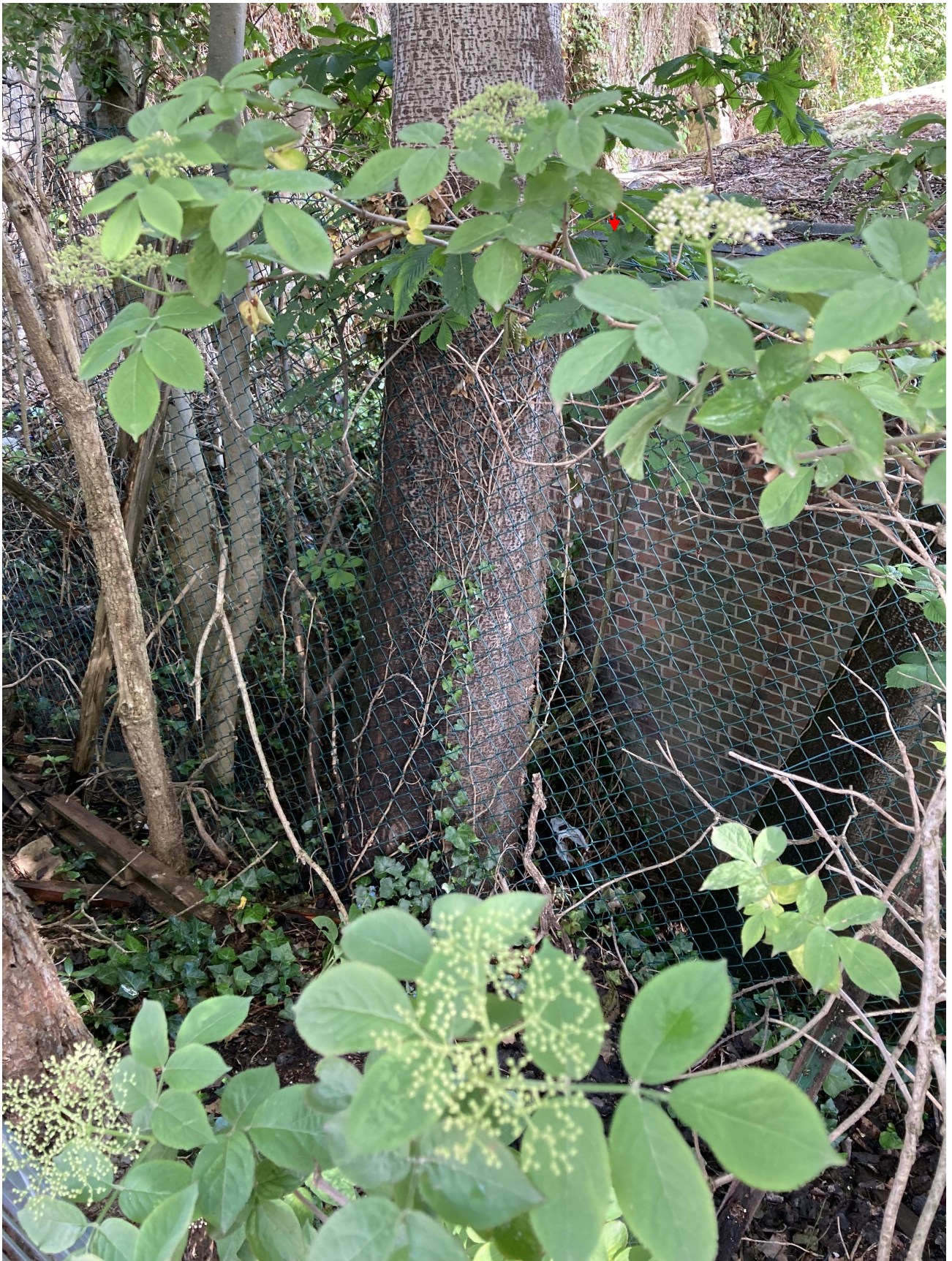
The Poplar overhangs the Hampstead sorting office and is about to outgrow its location.