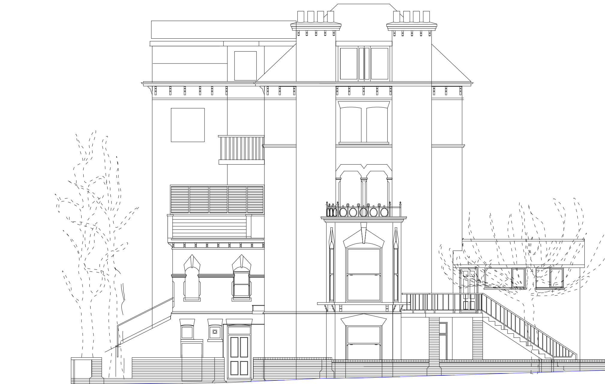
EXISTING NORTH ELEVATION (VIEW FROM PRINCE ARTHUR ROAD) (SCALE 1:100)