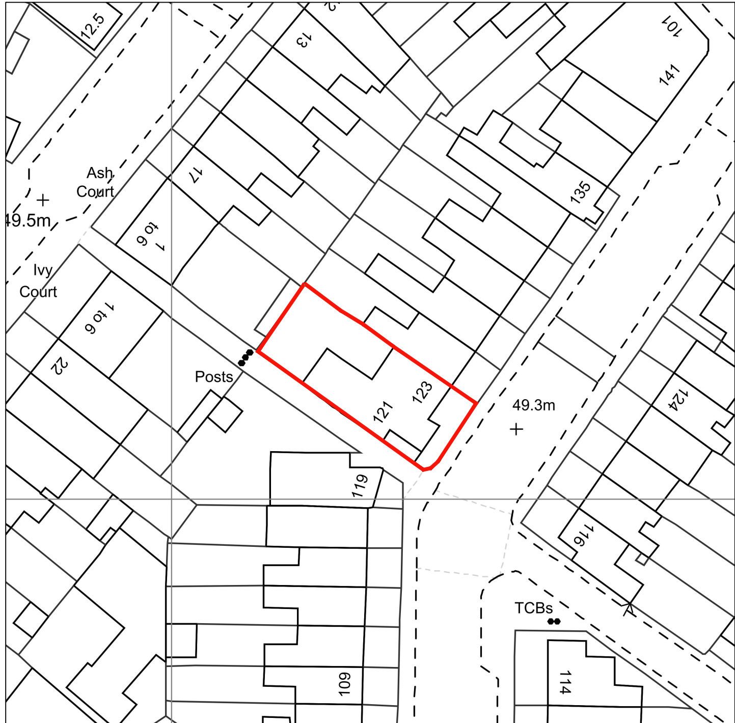
2 Block Plan Scale: 1:500 @ A3 Scale Bar 1:500 5 0 5 10 25 m