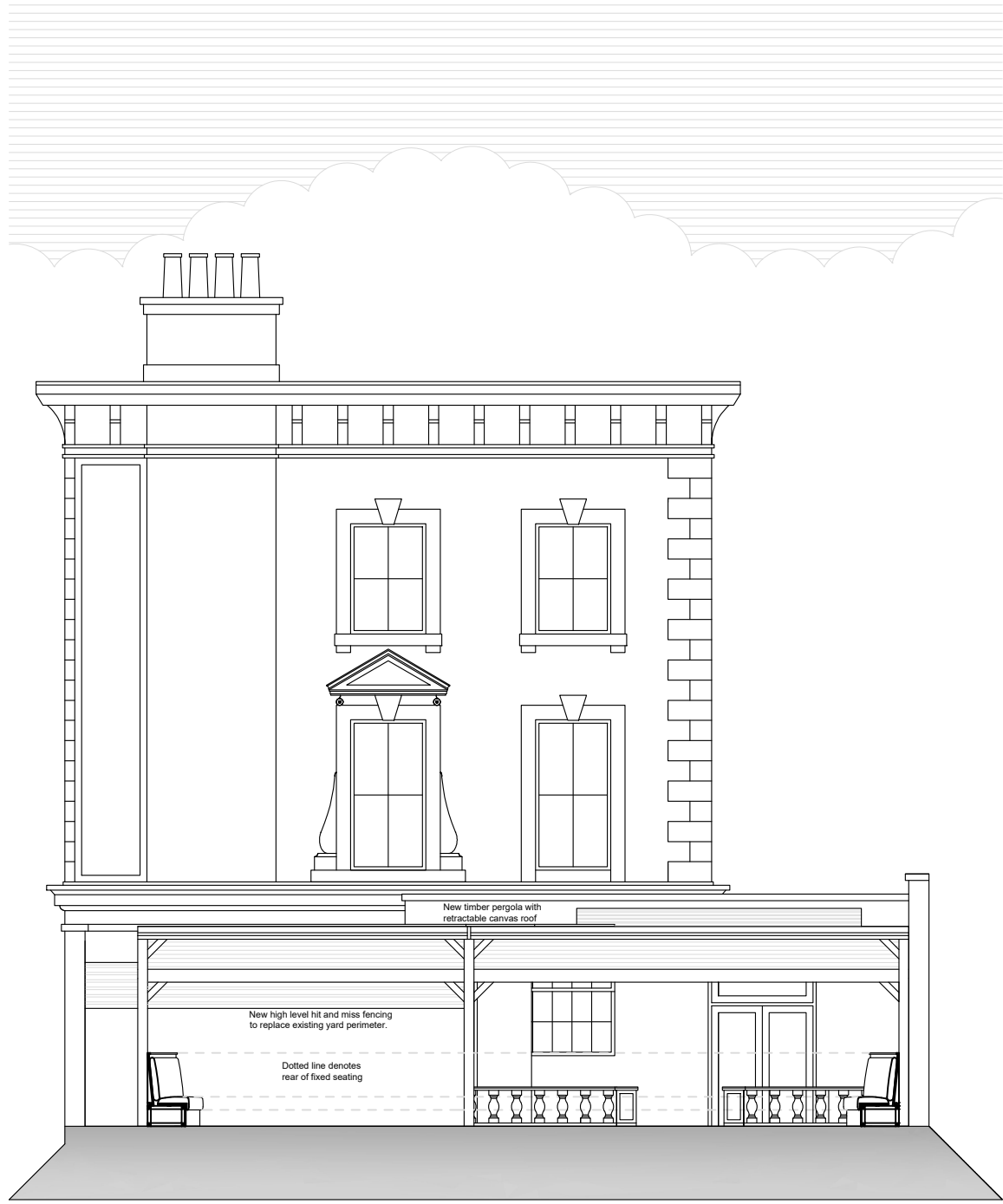
Proposed Rear Elevation 1:100