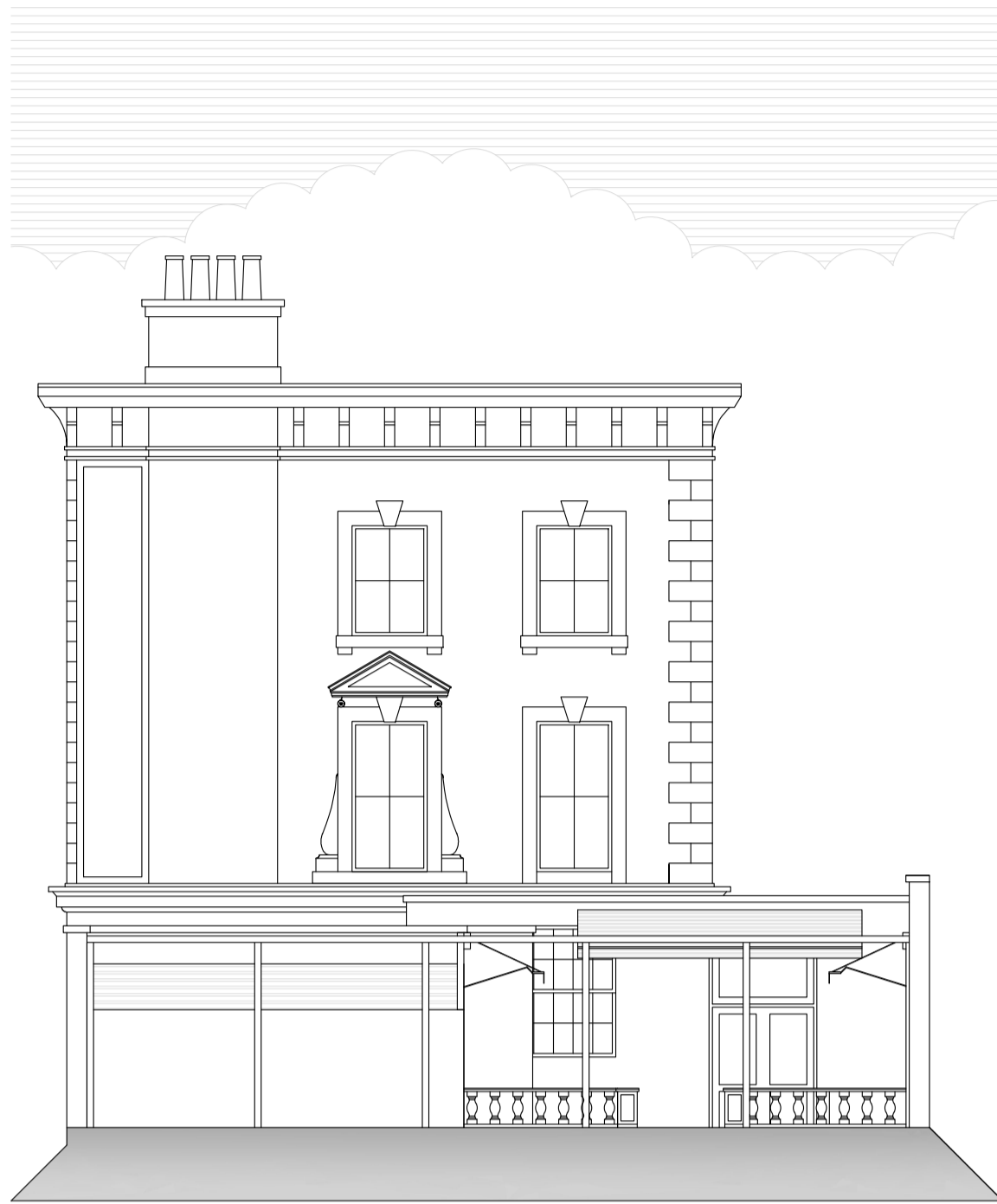
Existing Rear Elevation 1:100