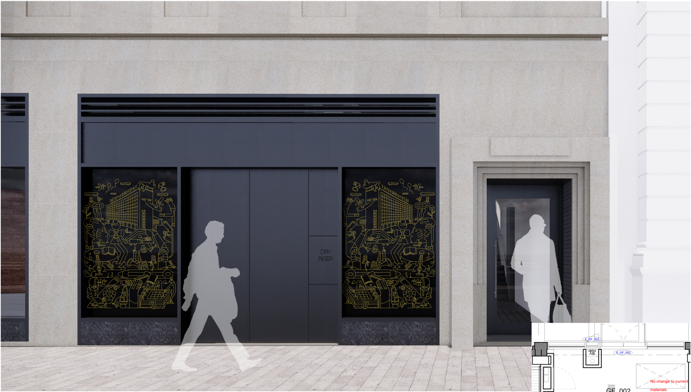
Indicative Artwork

....or have a more abstract, creative content.