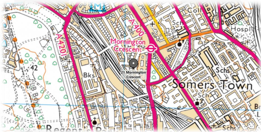
Figure 1: OS Map (Bing Maps)

Subsequently, this report has been produced, balancing the layout of the proposed development against the competing needs of trees. This report comprises all of the requisite elements of an arboricultural implications assessment, method statement and supporting plans.