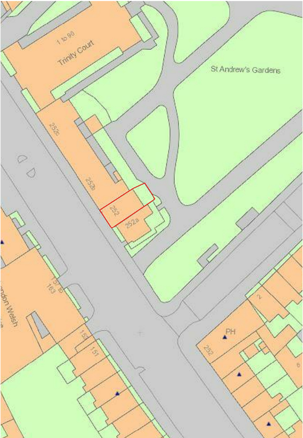
BLOCK PLAN 1 : 500 @A3