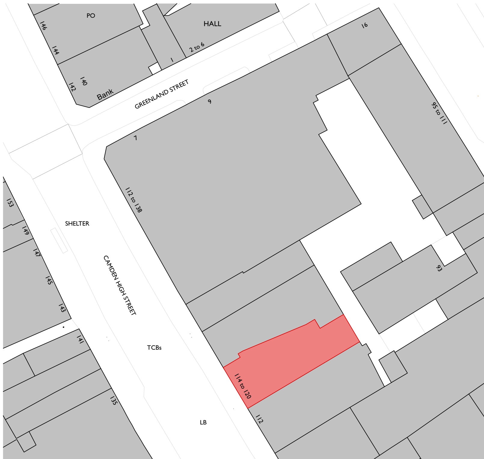
N BLOCK PLAN 0m 10 20 30 40 50 1:500 Scale Bar