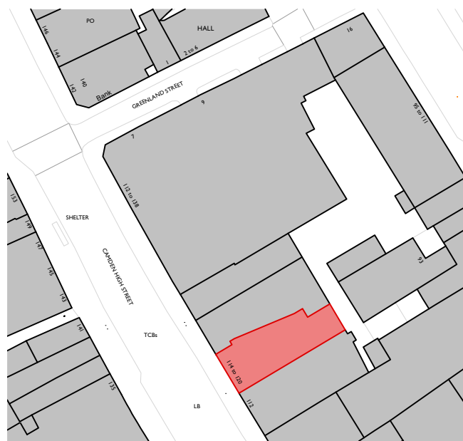
N OS PLAN 0m 10 20 30 40 50 1:1250 Scale Bar