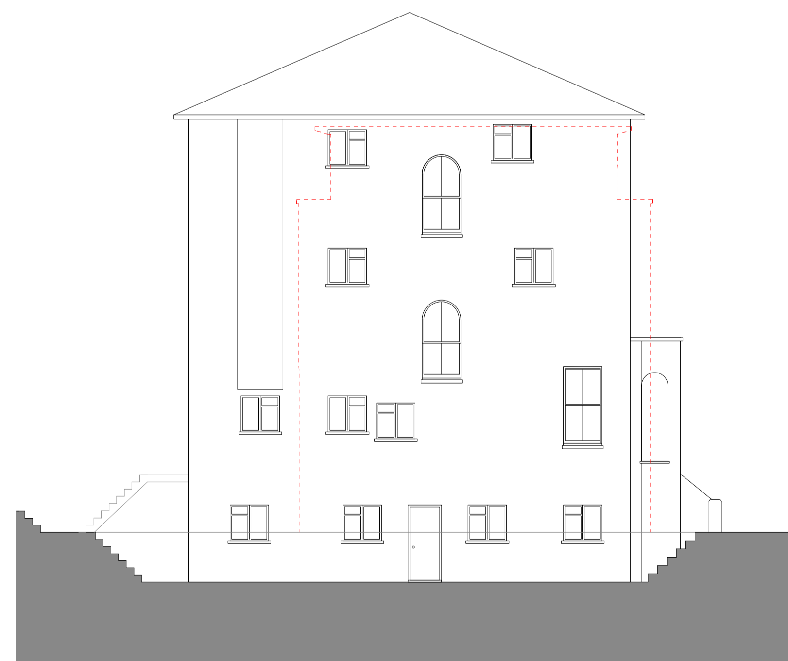
150 ABBEY ROAD PROPOSED WEST ELEVATION