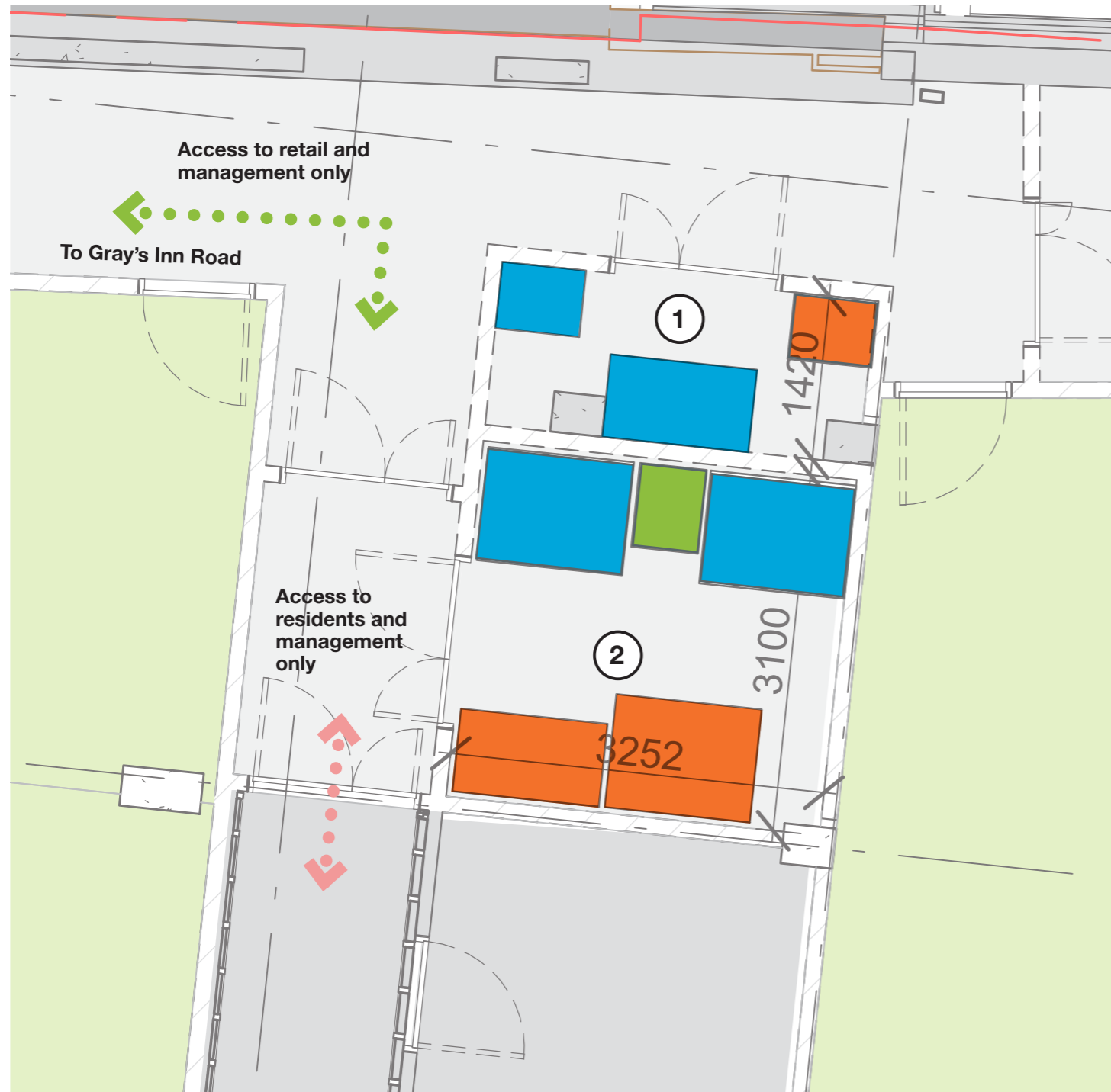
Retail and Residential Refuse Store at Gray's Inn Road