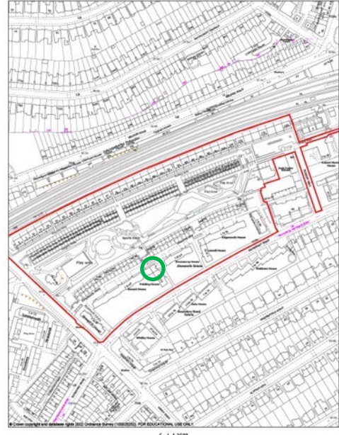
SHELL2 SIGN: NORTH EAST CORNER OF BESANT HOUSE