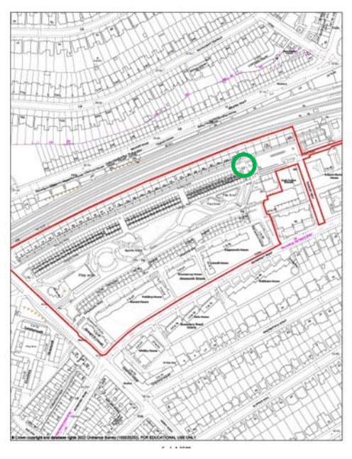
DIRECTIONS POLE: ROWLEY WAY