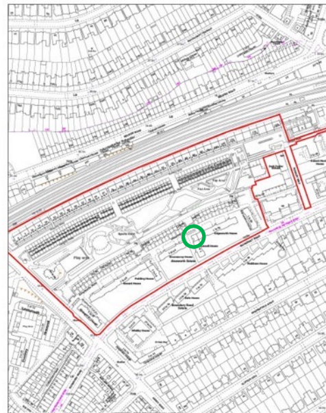
SHELL1 SIGN: SOUTHWEST CORNER OF EDGEWORTH HOUSE