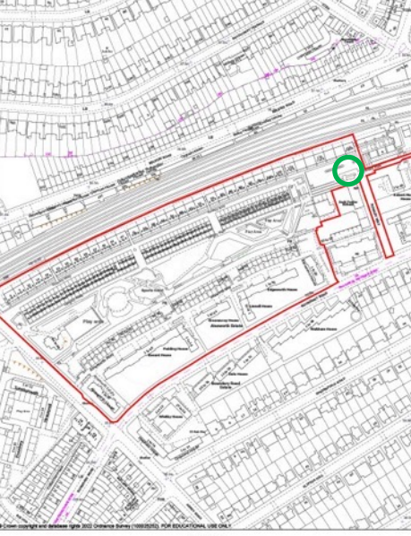
ARC SIGN: EXTERNAL SIDE OF STAIRCASE FROM CAR PARK TO LANGTRY WALK