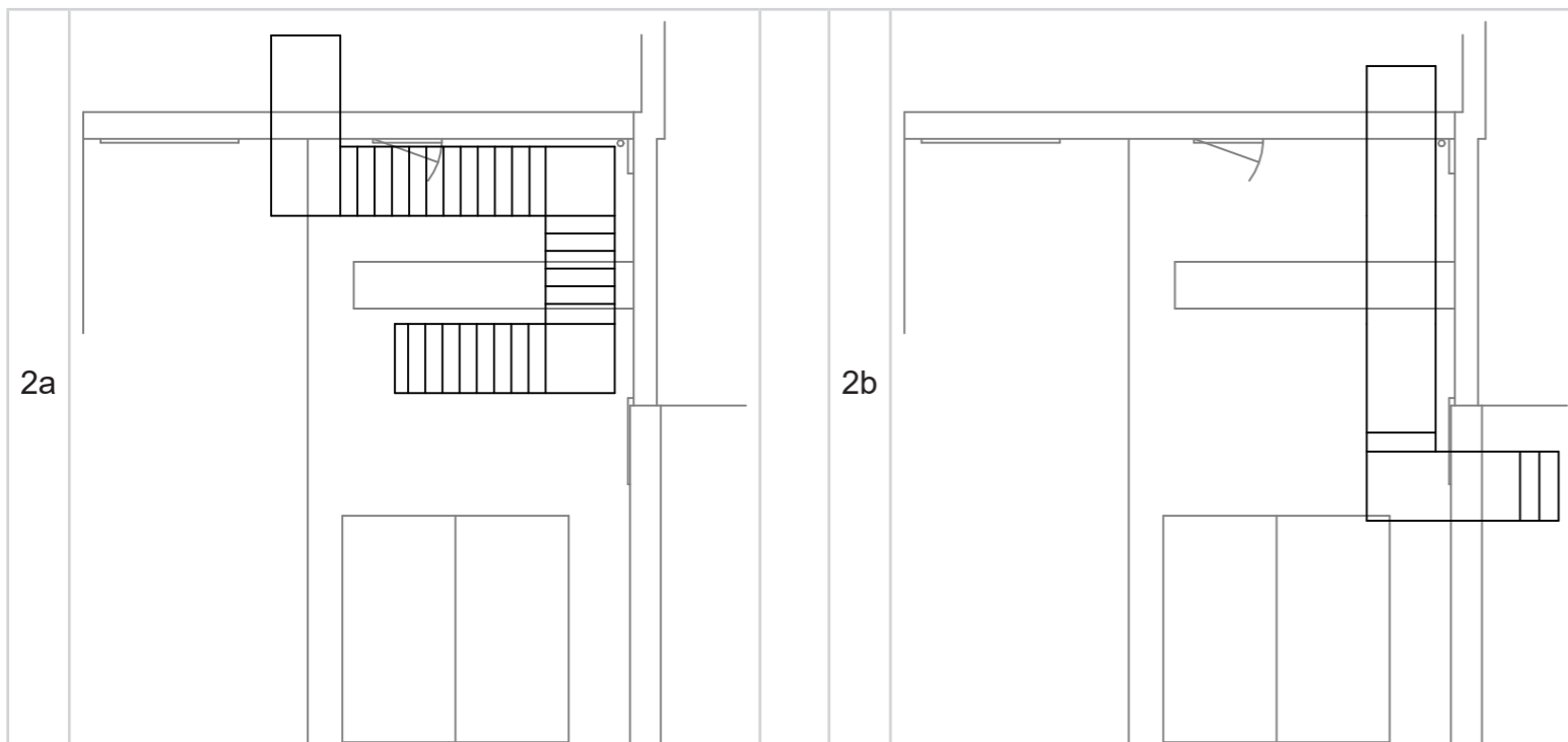
Plan view of demountable staircase