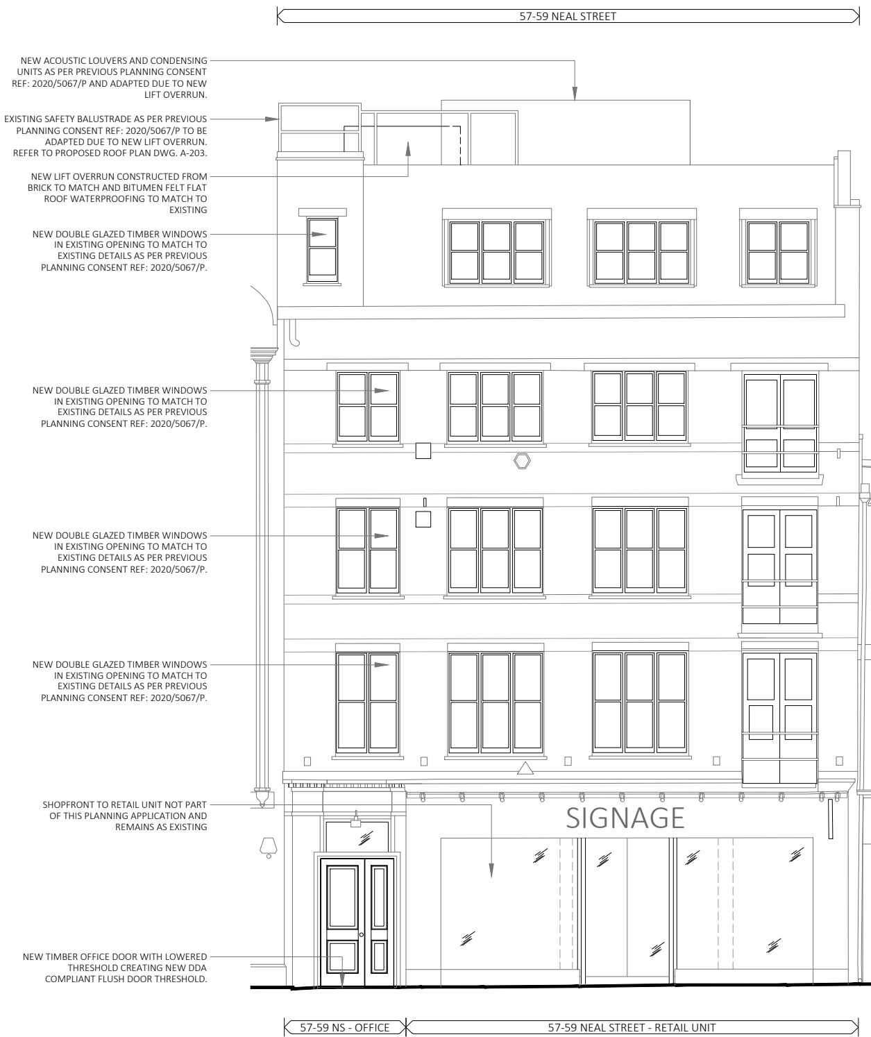
01 PROPOSED ELEVATION - NEAL STREET 1:100 @ A3