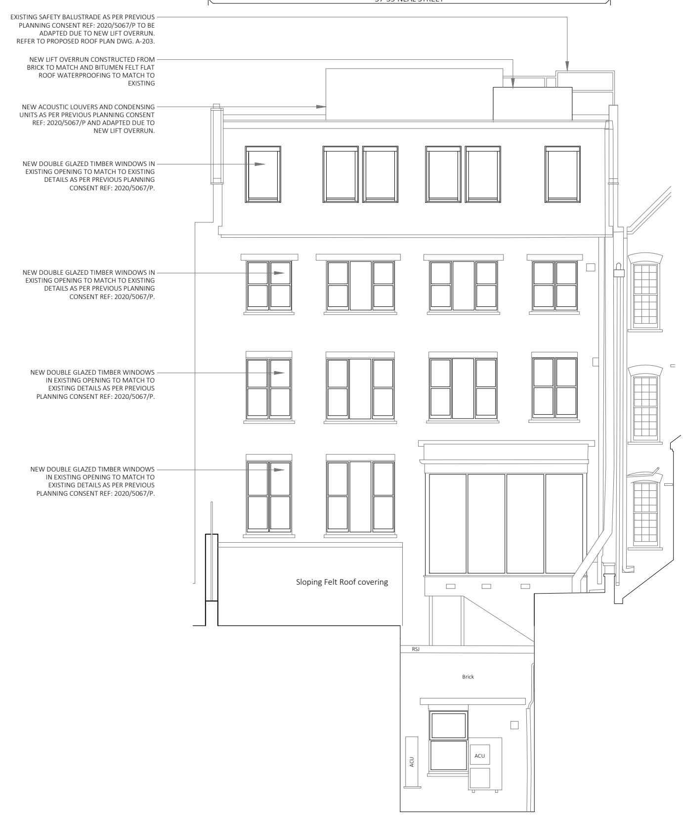
02 PROPOSED ELEVATION - REAR 1:100 @ A3