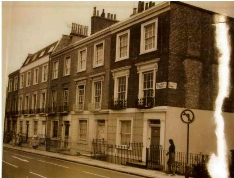
Picture of No 15-25 Delancey Street from 1976

The 2012 alterations also removed many of the non-original 20 th century partitions and the existing rear extension was also altered to enlarge the existing window openings to form two single large full-height window / door openings at basement and ground floor level providing views and access to the rear garden area. As part of the 2012 alterations the rear garden was also lowered with a new stepped terraced garden formed to the south end of the garden. This included the removal of the existing garden retaining wall visible on the approved 1980s scheme.